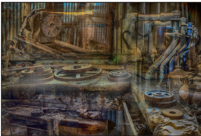
“Bodie Workshops”