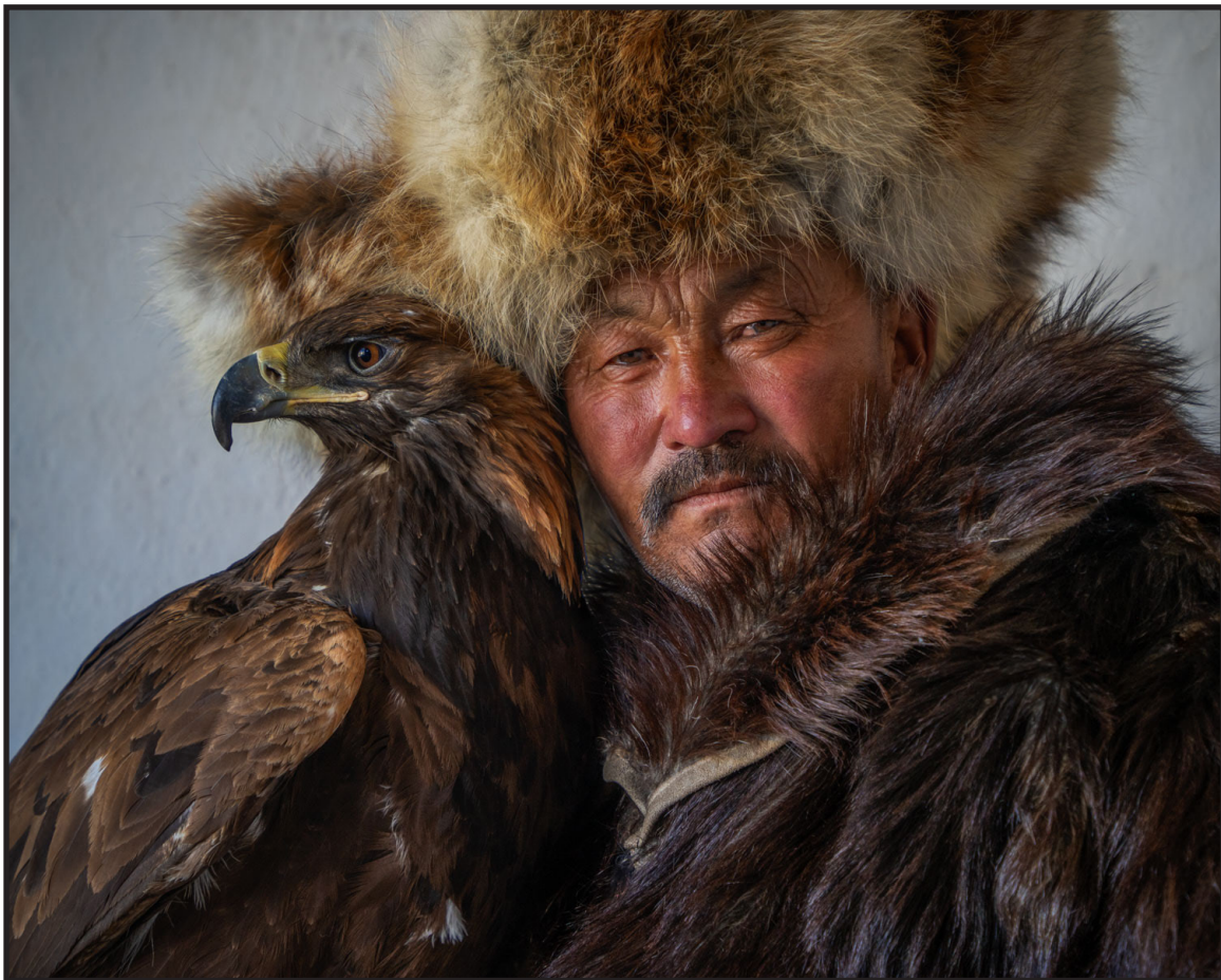
The Eagle Hunter by Jan Lightfoot