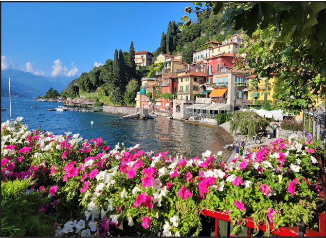
“Lake Como Seen from Varenna Italy”