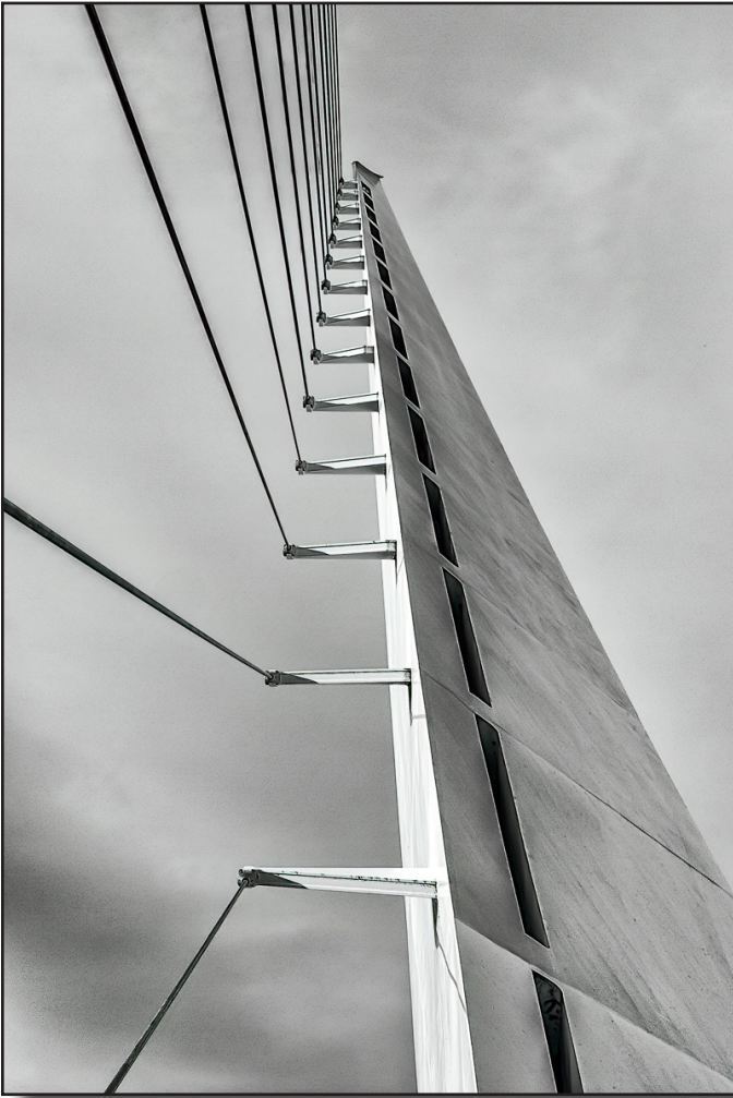
“Sundial Bridge”