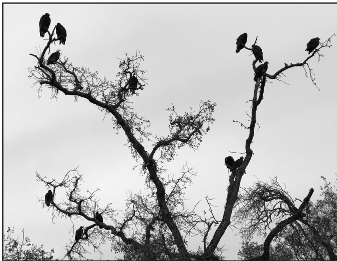
“Thirteen Vultures Must Be Bad Luck” By Gert vanOmmering