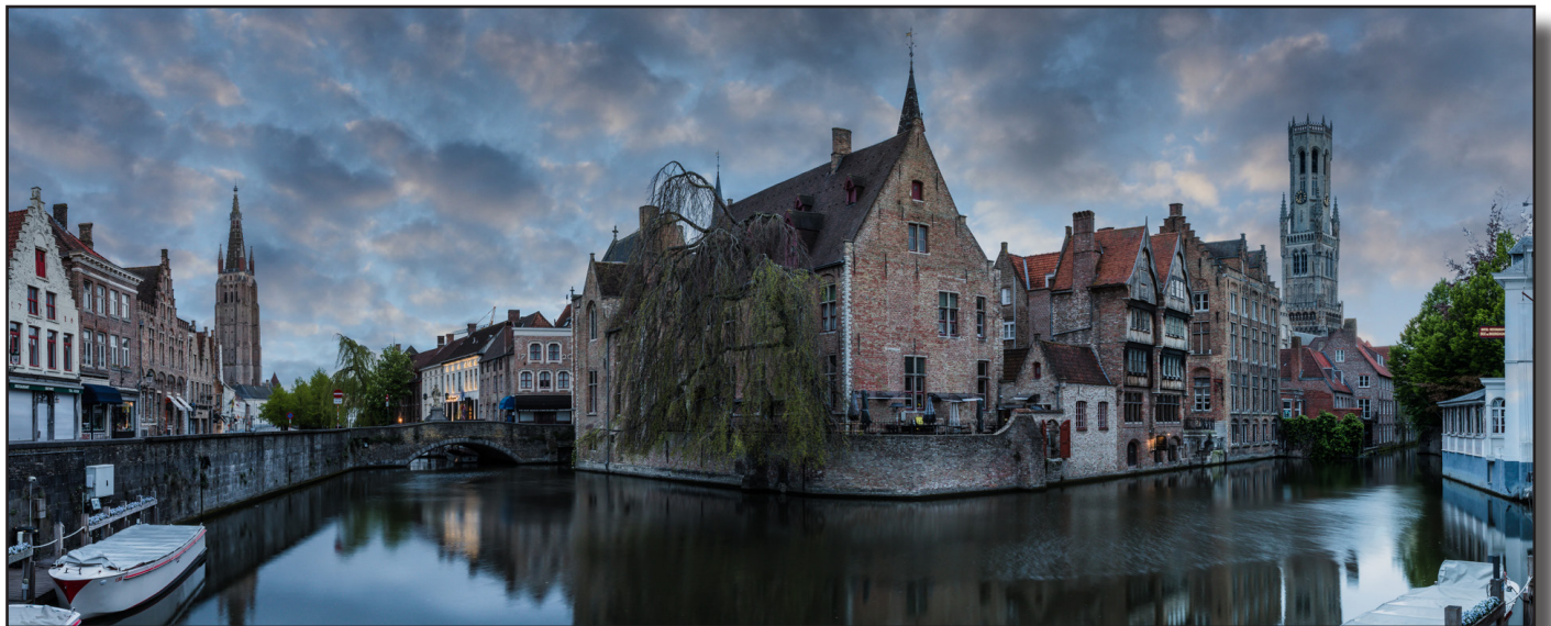
“Early Morning Bruges Belgium”