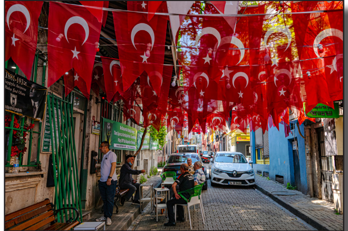
“Street Life Istanbul Turkey” by Don Goldman