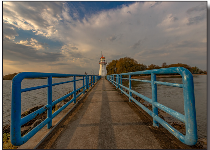
“Cheboygan Crib Lighthouse Michigan”