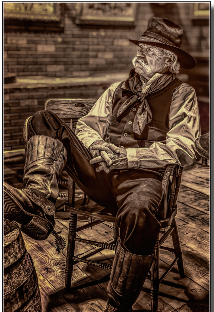
“Watchful and Wary.” By Lucille vanOmmering