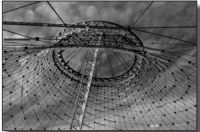
“Structure from the Worlds Fair in Spokane” By Laura Berard