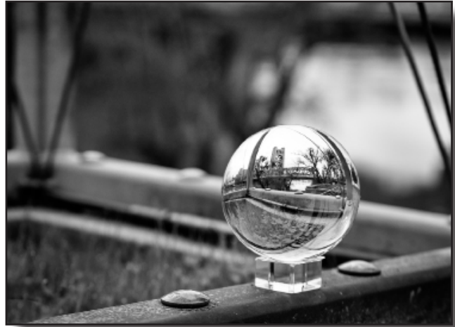
“Tower Bridge in Lens Ball”