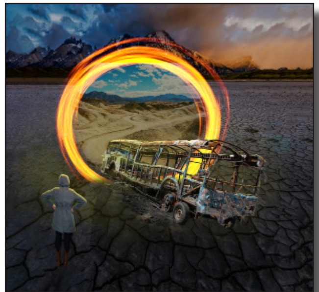
“Broken Portal” by Don Goldman