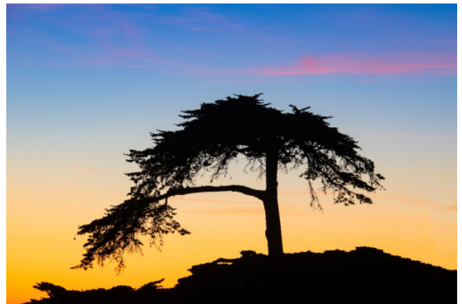
“Silhouetted Tree Pebble Beach” by Heather Cline