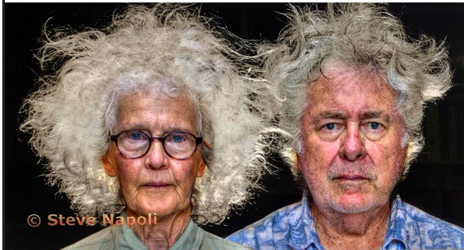
Creative Projected - 1st Masters