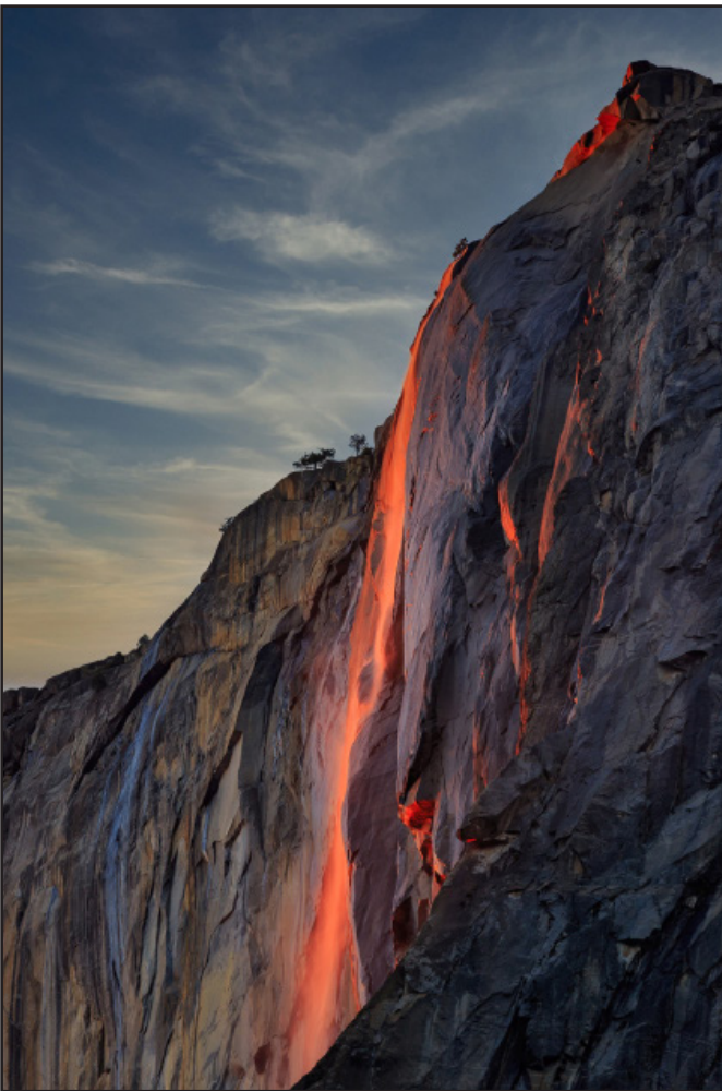
“Horsetail Falls”