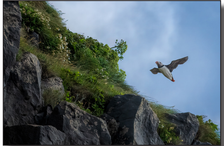
“Puffin in Flight Iceland “ by Lucille van Ommering