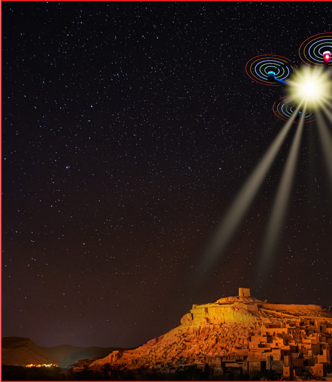
“First Contact” by Don Goldman