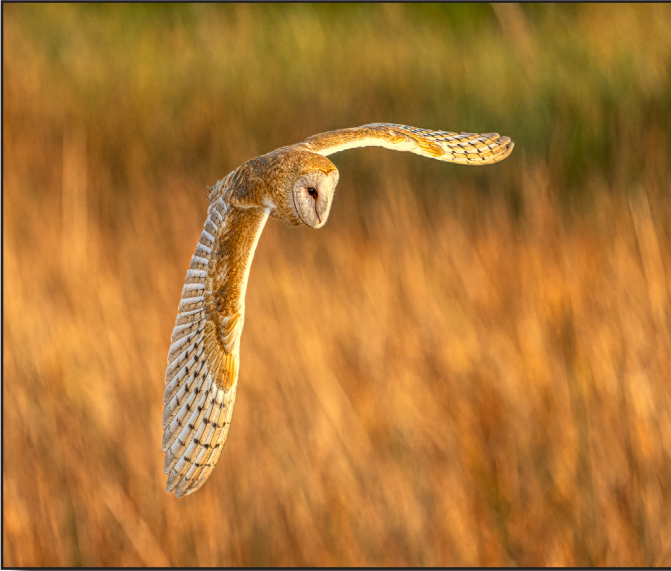
“Barn Owl in Flight” by Goldman Don