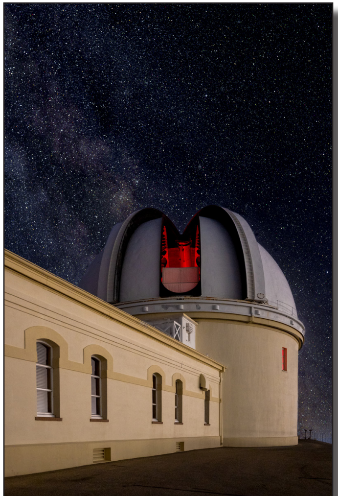
“Night at the Observatory” by Jan Lightfoot