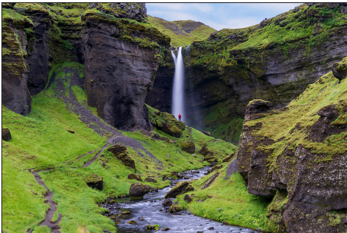
“Seljalandsfoss Iceland” by Gert van Ommering