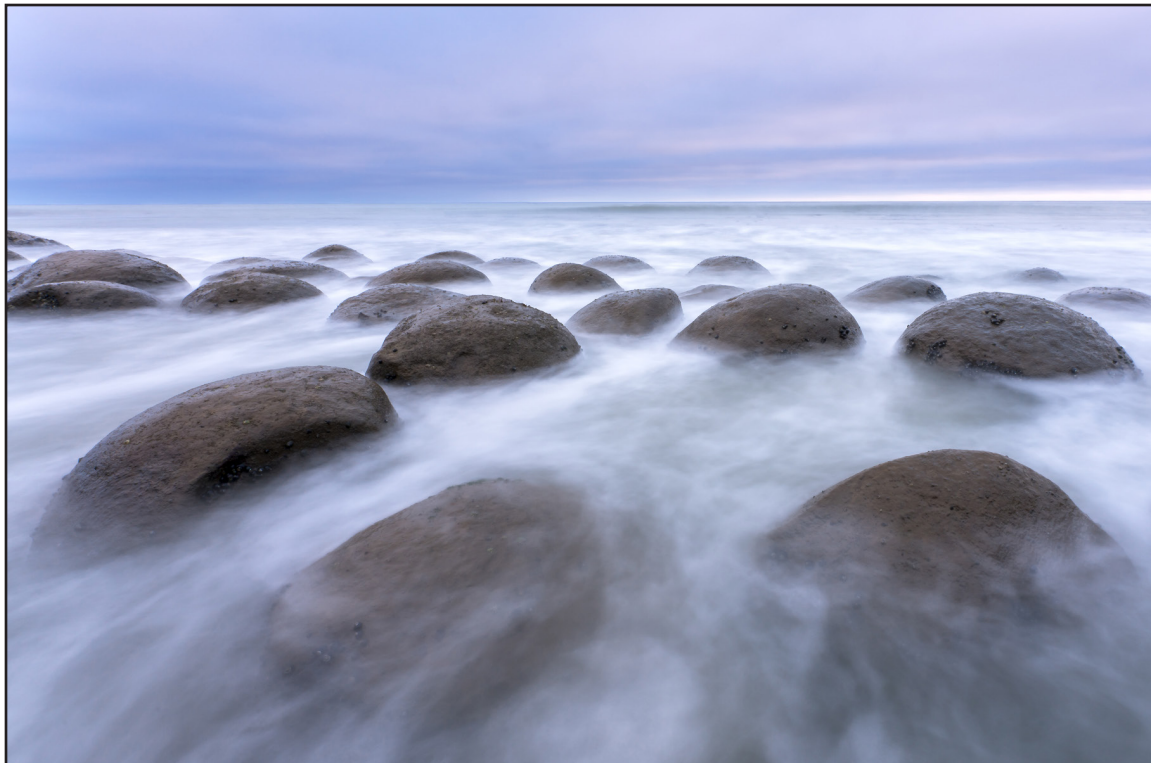
” Edge of Tranquility” by Jan Lightfoot