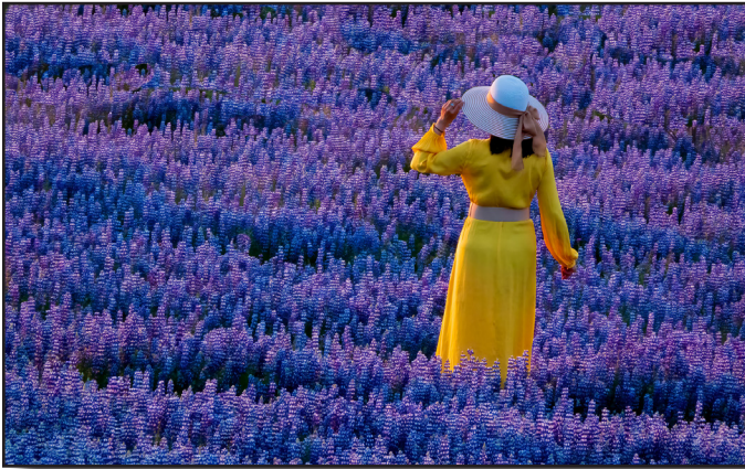
“Lupine Lady at Sunset” by Gert van Ommering