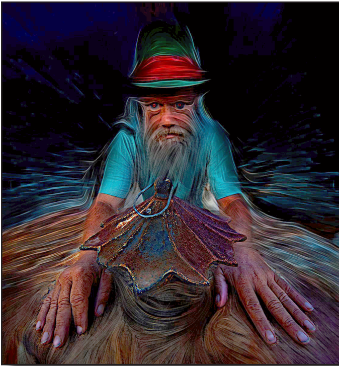
“Darwin Mayor” by Truman Holtzclaw