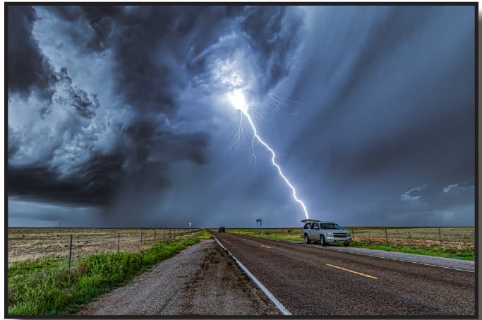
“Right Place, Wrong Time” by Don Goldman