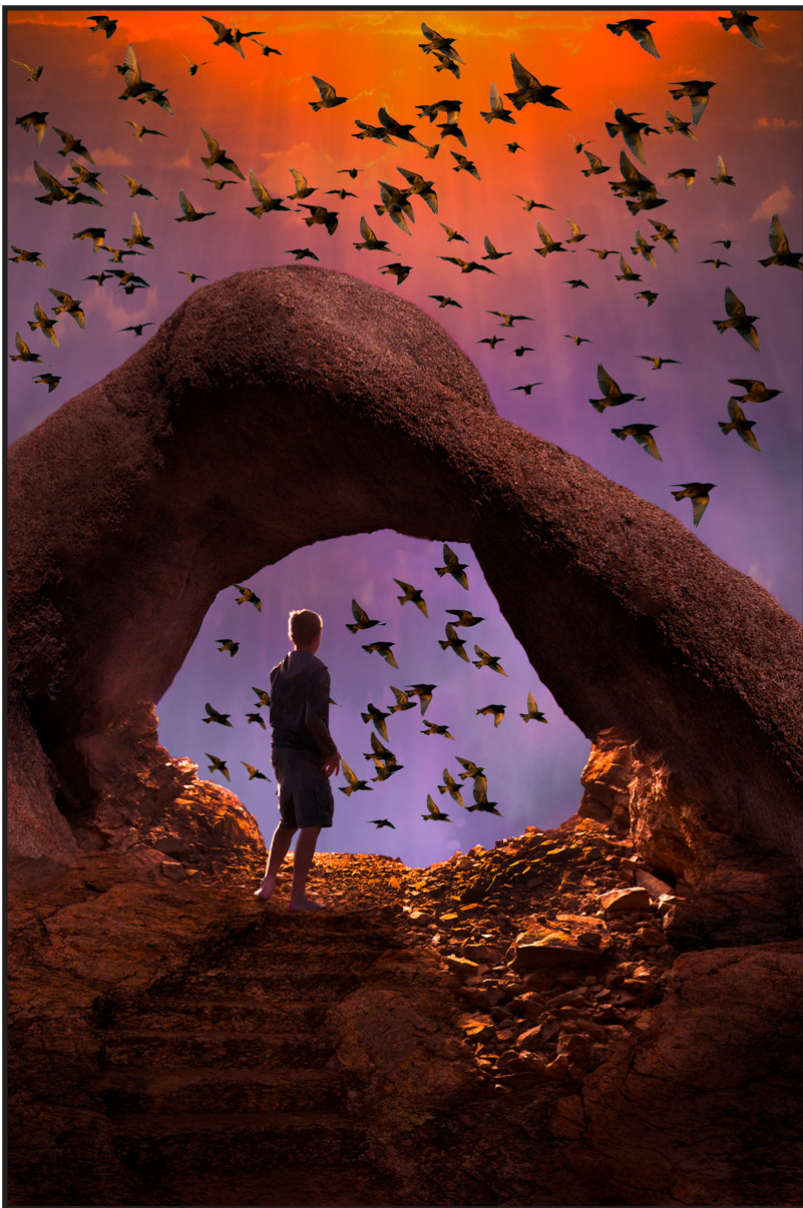
Creative Image of the Night "Dreaming of A Different World" by Jan Lightfoot

Volume 85 Number 8 * August 2021 * www.sierracameraclubsac.com