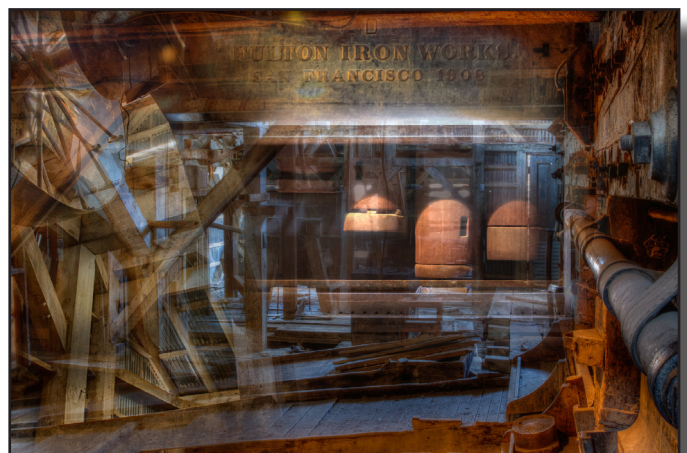
“Bodie Stamping Mill”