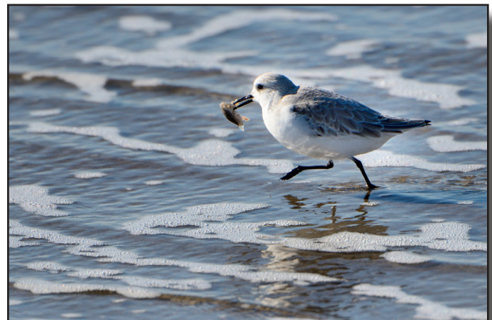
“Beachcomber” by Evan Wong