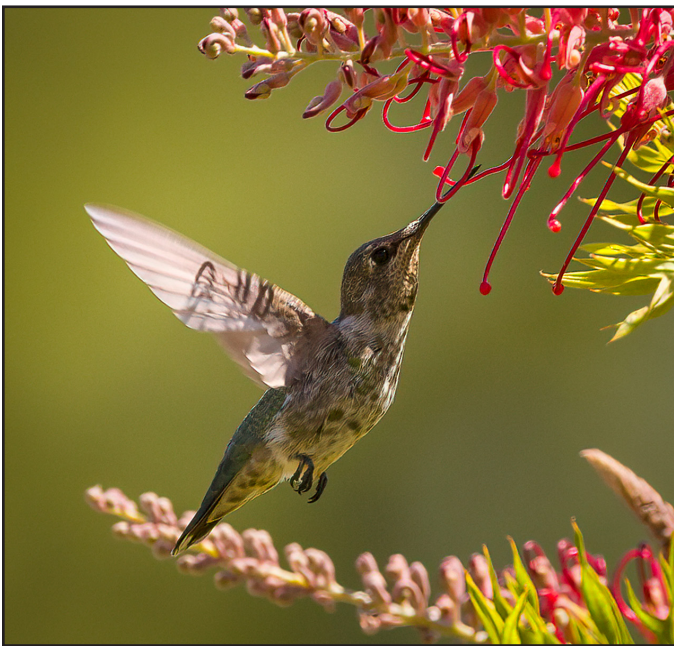
“Anna’s Hummingbird”