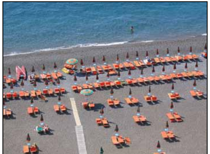
“Positano Beach” by Gary Cawood