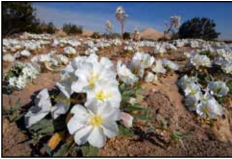
“Desert Primrose” by Willis Price