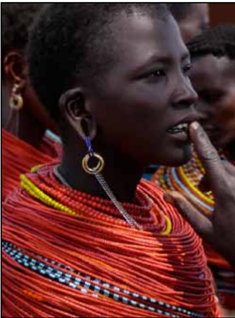
“Samburu Woman” by Valarie Trudeau