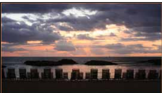
“Oahu Beach Sunset” by Peggy Seale