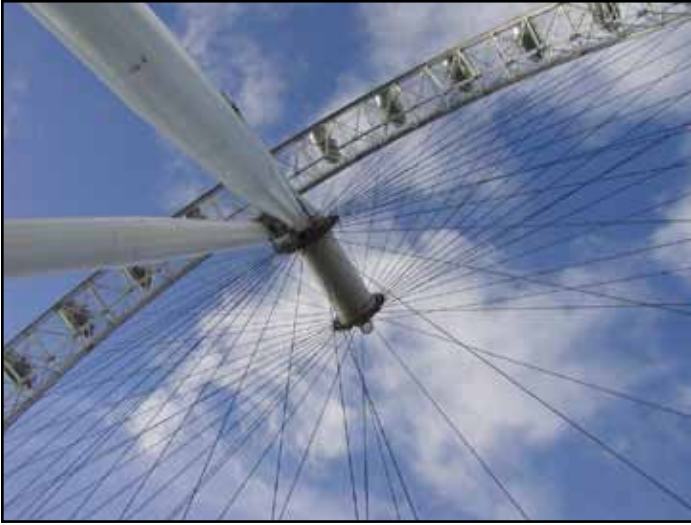
“One Big Wheel” by Allan Trimble