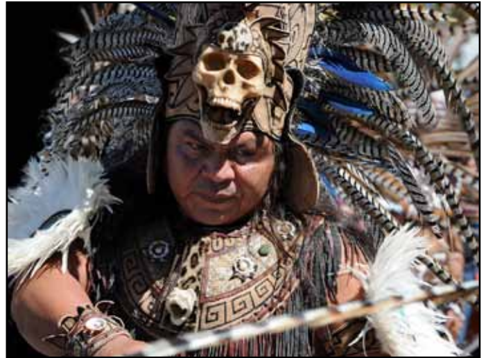
“Aztec Warrior” by Willis Price