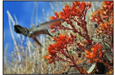
“Juvenile Anna’s Hummingbird Feeding”