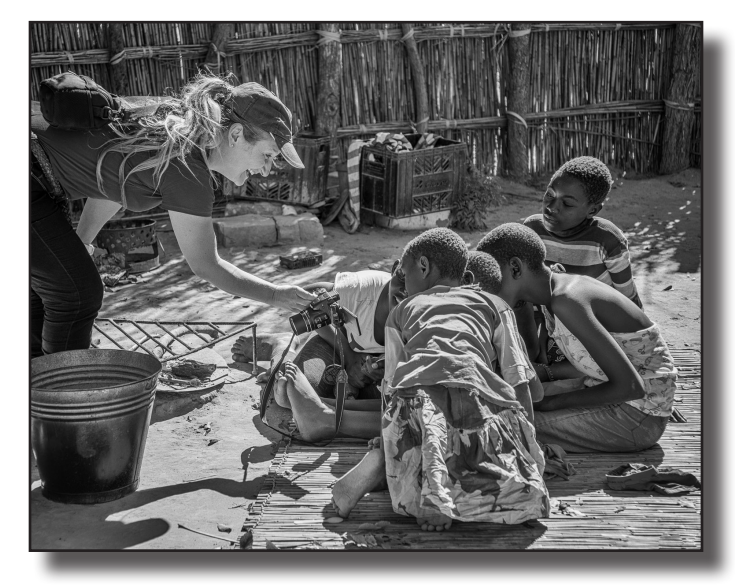
"Seeing Themselves Chobe River Botswana" By Pat Honeycutt