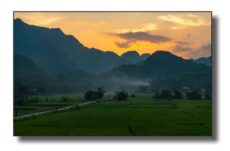
"Sunset Mai Chau Vietnam"