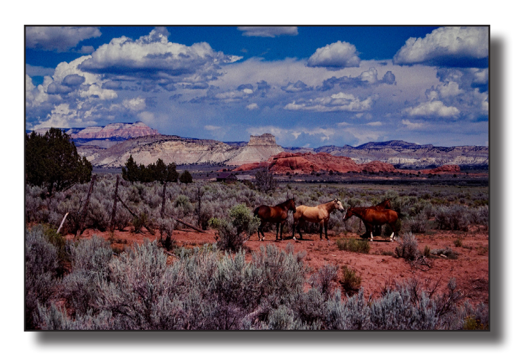
"Horses Near Cannonville UT" By Robeert Benson