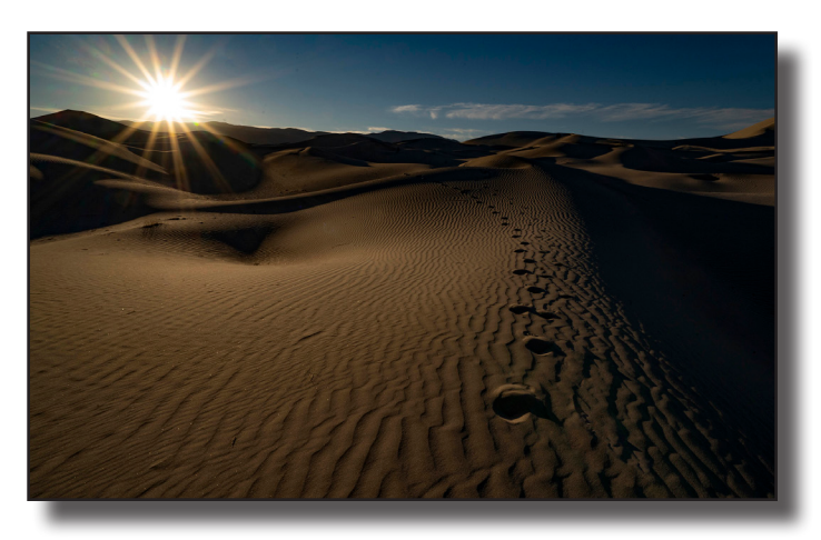
"Sunset Eureka Dunes, DV " By Truman Holtzclaw