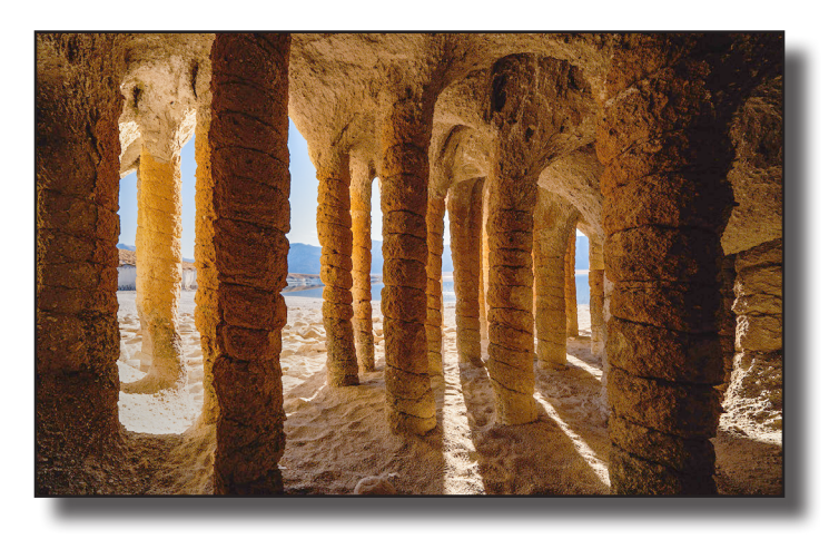
"Crowley Lake Columns" By Truman Holtzclaw