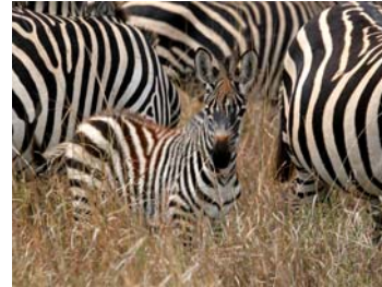
S Holtzclaw "Zebra Foal"