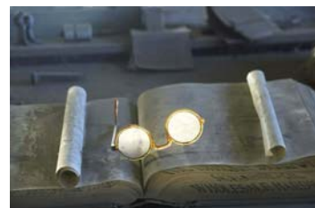
Herron "Catalog & Glasses Bodie"