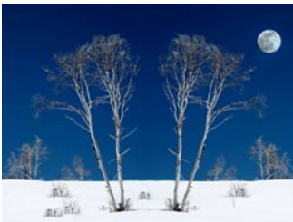
T Holtzclaw "Winter Moon"