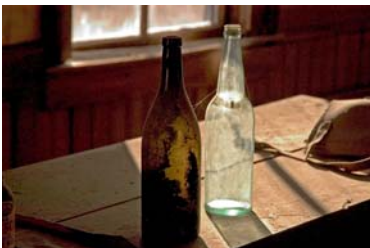
Herron "Bottles on Bodie Bar"