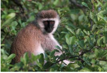
Sturla "Thoughtful Monkey"