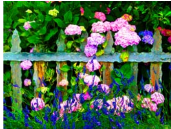
T Holtzclaw "Fence & Flowers"