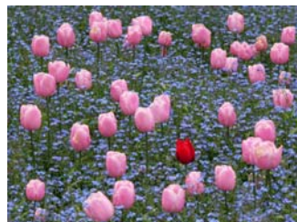
"Filoli Tulips"