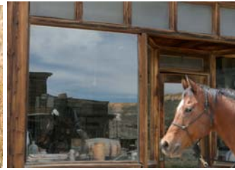
G Kent "Bodie Reflection"