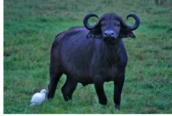
Sturla "Buffalo & Egret"