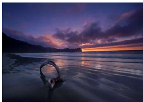
HEATHER CLINE — CRESCENT BEACH