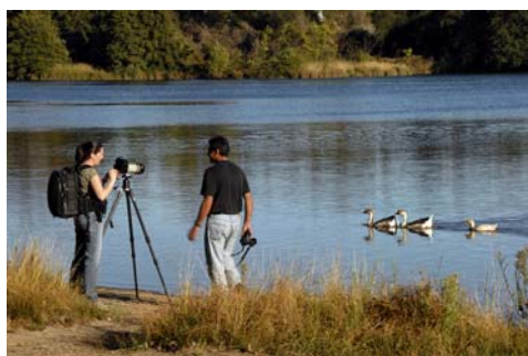
FARZAD & HEATHER, W. PRICE