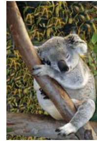
Scheer "Koala Sleeping"