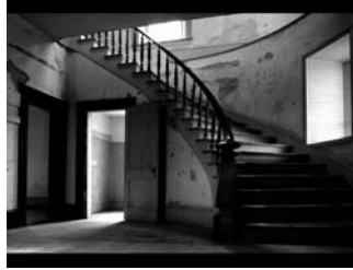
R Parker "Hotel at Bannock" SLIDE OF THE NIGHT