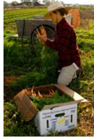
Ueltzen "Organic Carrots"