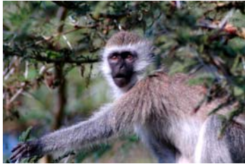
Sturla "Monkey's Eyes"