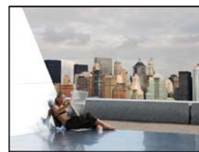
Hubbell "Casual Reader"