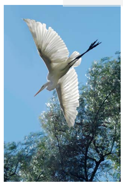
WILLIS PRICE "Great Egret in flight"