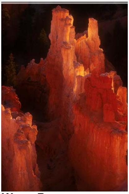
WILLIS PRICE "Bryce At First Light"