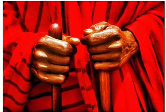
SLIDE OF THE NIGHT: "HANDS" BY: LAURIE FRIEDMAN