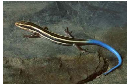
SLIDE OF THE NIGHT: “JUVENILE WESTERN SKINK WARMS IN MORNING LIGHT” BY: TRUMAN HOLTZCLAW

Peggy Gidding “Caterpillars and habitat” Jim Cehand “Pink Star Onion and flowers” and “Fly Agaric mushrooms” Truman Holtzclaw “Point Lobos rock patterns” and “Juvenile Western Skink warms in morning light”