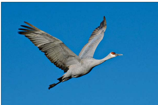
SLIDE OF THE NIGHT: “SANDHILL CRANE FLIGHT” BY: JULIUS KOVATCH