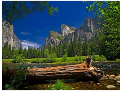
KOVATCH "BRIDALVEIL FALLS"