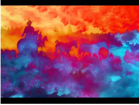
W. PRICE "GHOST RIDERS"