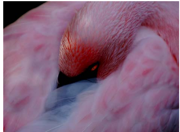
DIGITAL IMAGE OF THE MONTH