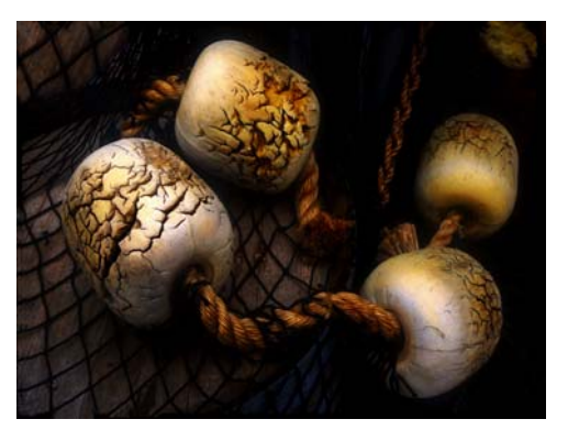
"FISH NET FLOATS"