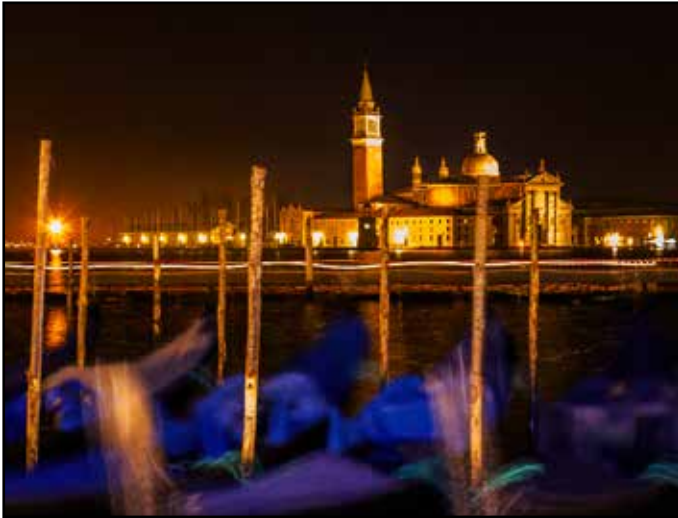
"Venice Evening Light" by Truman Holtzclaw