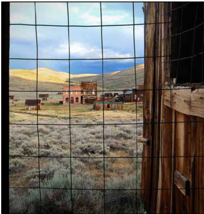
"Bodie Early Morning" by Peggy Seale