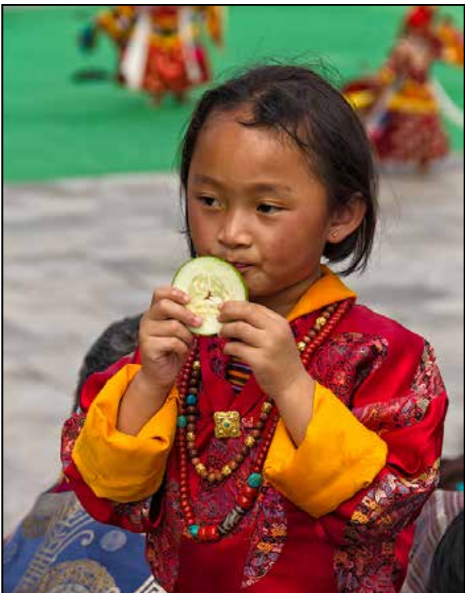
"Bhutanese Girl with Cucumber Snack" by Gary Cawood