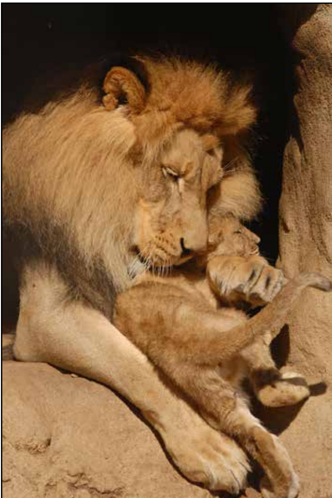
“Sacramento Zoo, Father and Son”