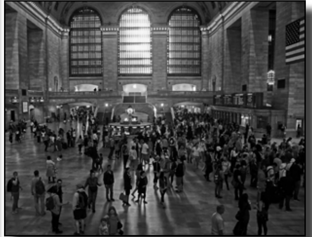
“Grand Central Terminal NY” by Jeanne Snyder