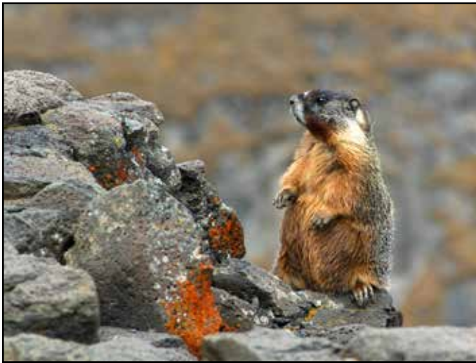
"Marmot, Washington State"