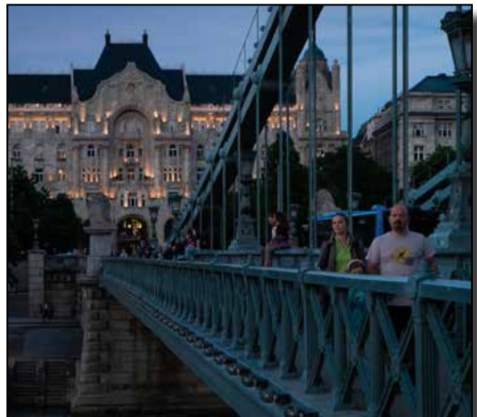
"Crossing Chain Bridge, Budapest" by Theo Goodwin