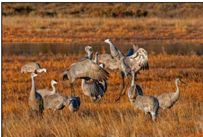
"Sandhill Crane Fight" by Julius Kovatch