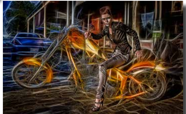
"Lady Biker" by Truman Holtzclaw