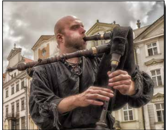
"Medieval Bagpiper, Prague" by Theo Goodwin