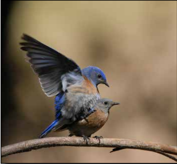
"Western Blue Bird Courting" by Bob McCleary