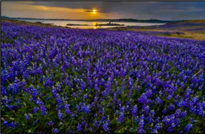
“Lupine Sunset” by Truman Holtzclaw