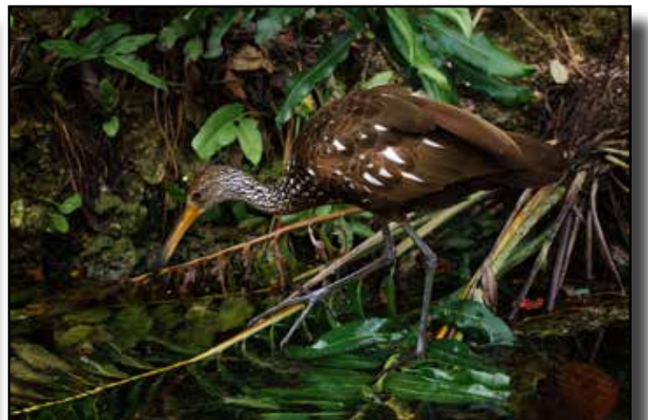
"Limpkin, Yucatan, Mexico" by Theo Goodwin