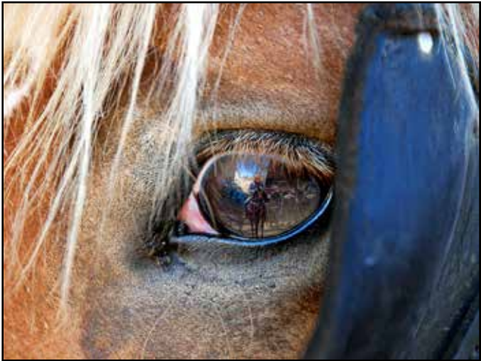
"Reflections of the Past" by Willis Price