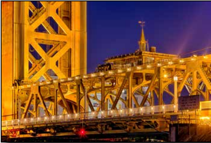
"Tower Bridge" by Gary Cawood