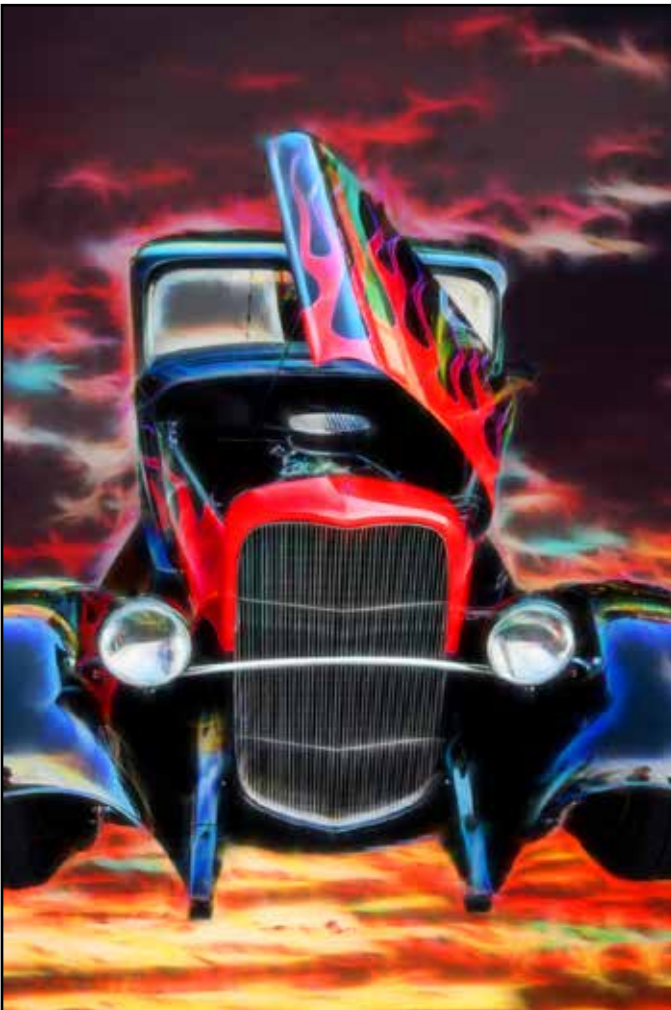
"Flying Hot Car" by Donna Sturla