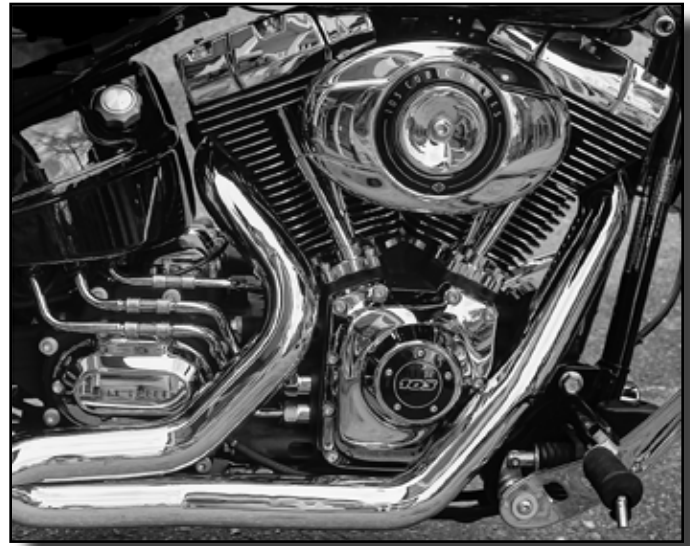
"Chrome in Locke" by Werner Krueger