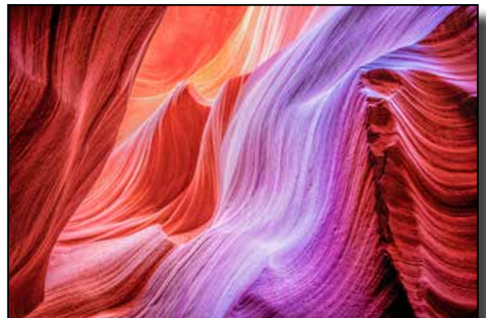
"Purple Waterfall, Antelope Slot Canyon" by Cheryl Glackin