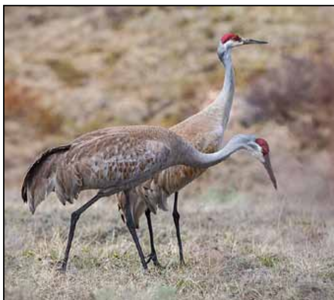
“Sandhill Cranes in Yellowstone Field” by Lynne Anzelc