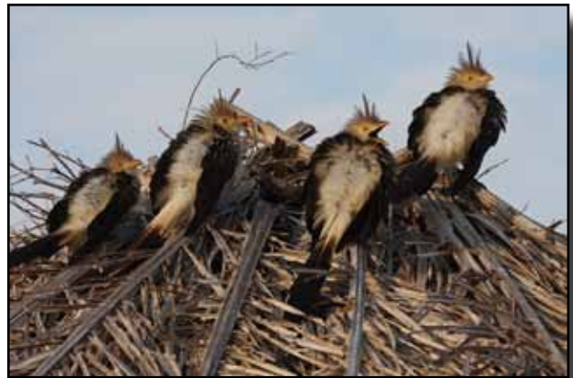
“Guira Cuckoos”