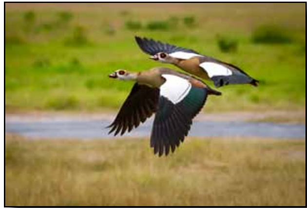
“Egyptian Geese Taking Flight” by Jan Lightfoot