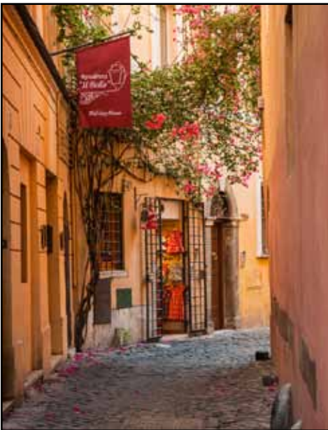
“Residenza Il Bollo, Rome”