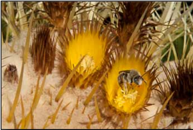
“Cactus Flower with Bee” by Donn Reiners