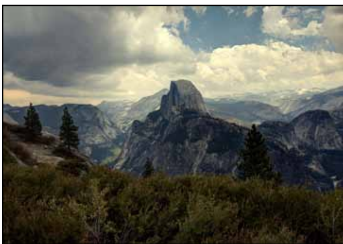
“Half Dome from Glacier Point Yosemite”