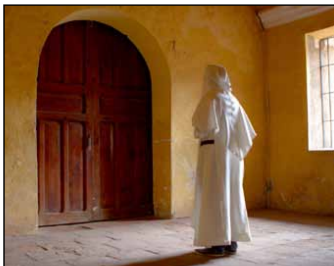
Color Print Division "Novice Priest Before Monastery Door" by Theo Goodwin