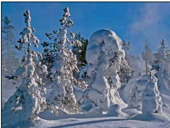
“Ghost Trees at West Thumb” by Julius Kovatch