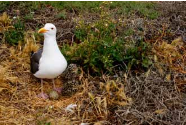
“Sea Gulls Hatching on Anacapa Island” by Jeanne Snyder