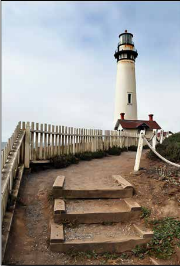
“Pigeon Point Lighthouse” by Werner Krueger