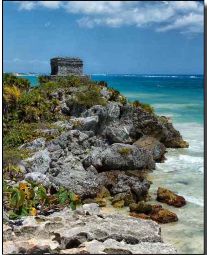
“Mayan Monument, Tulum, Yucatan Mexico” by Theo Goodwin