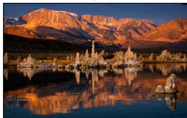
“Mono Lake” by Truman Holtzclaw