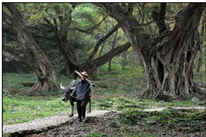
“Forest Trail, Fujian” by Willis Price