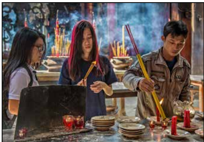
“Vietnam Blessing Ceremony” by Lynne Anzelc