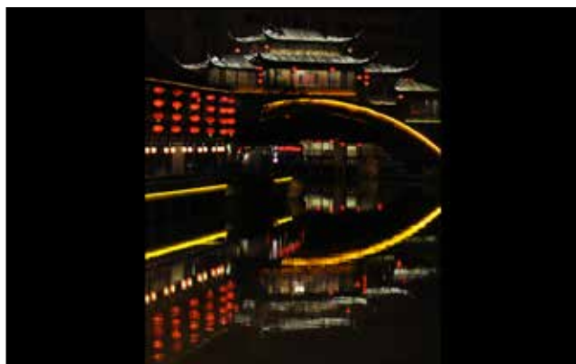
“Songcheng Reflection, Hangzhou China” by Willis Price