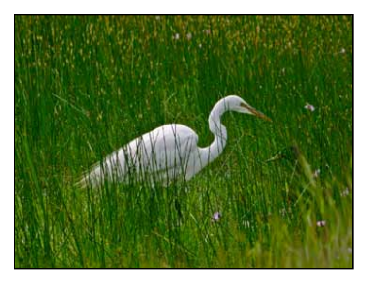
"Heron vs. Duck" by Gary Cawood