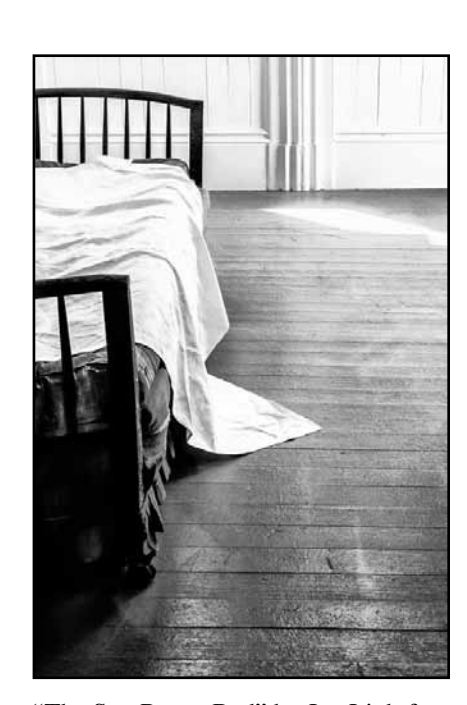
"The Sun Room Bed" by Jan Lightfoot