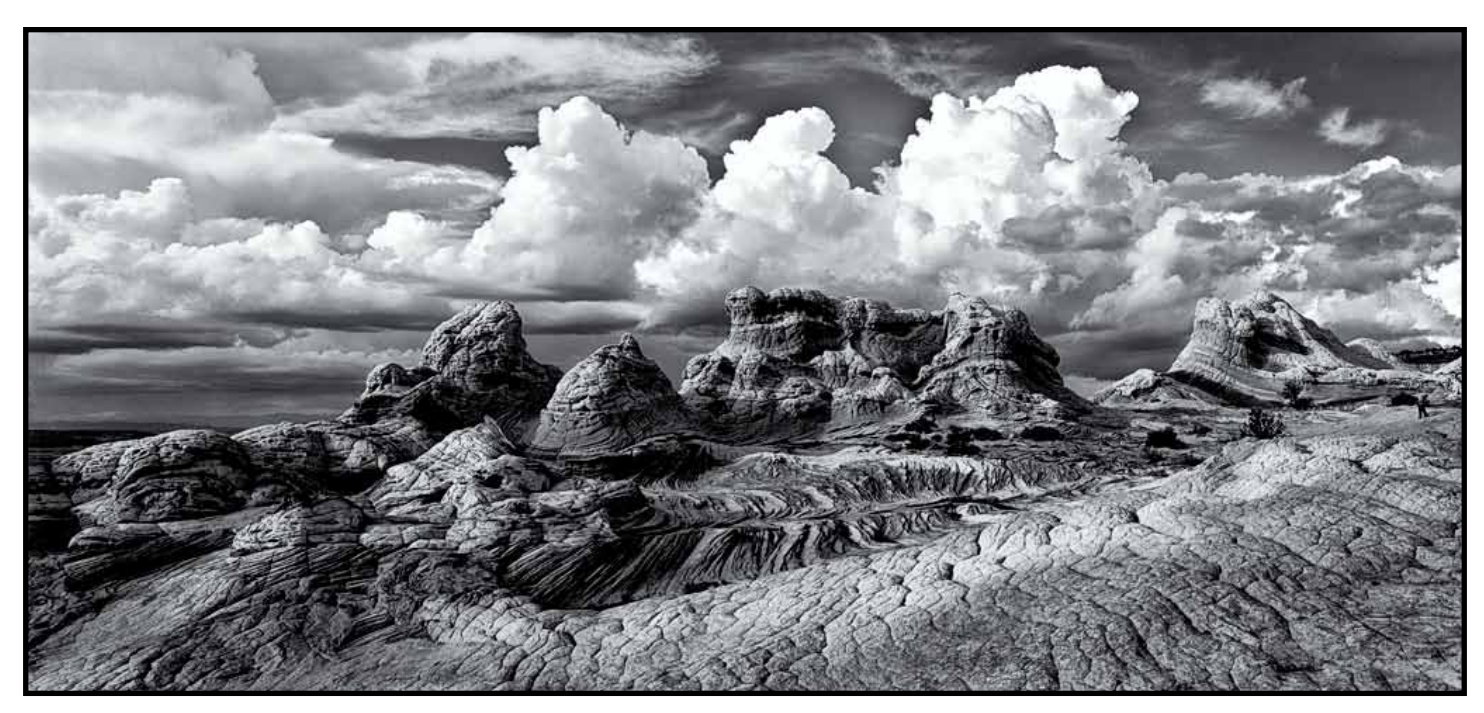
Monochrome Print "White Pocket Panorama" by Ron Parker