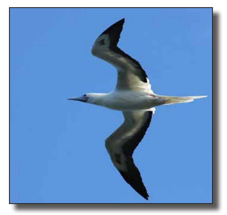
"Red-footed Booby"