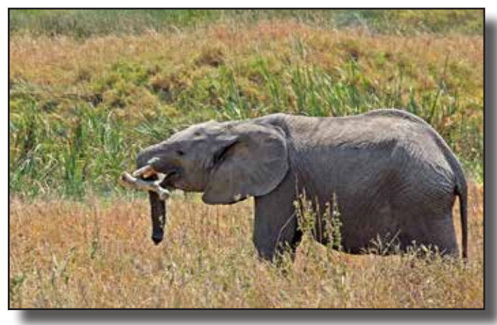
"African Elephant Calf Teething on Elephant Femur"