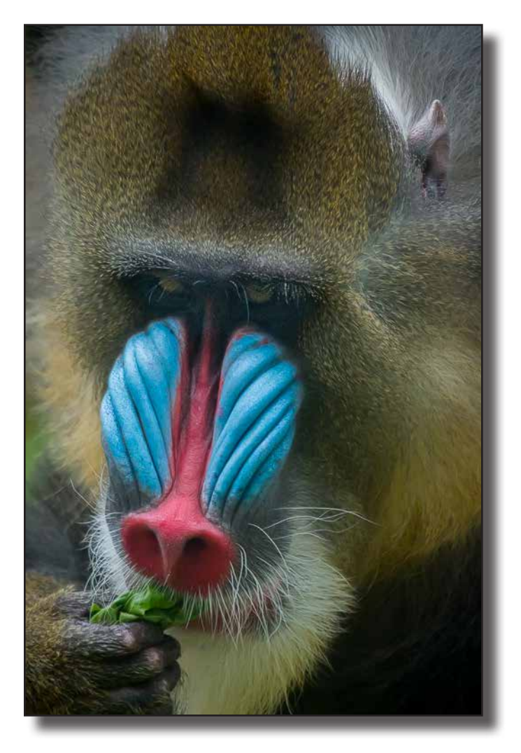
"Mandrill at Oregon Zoo"