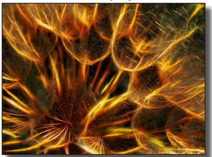
"Oyster Plant at Sunset" by Donna Sturla