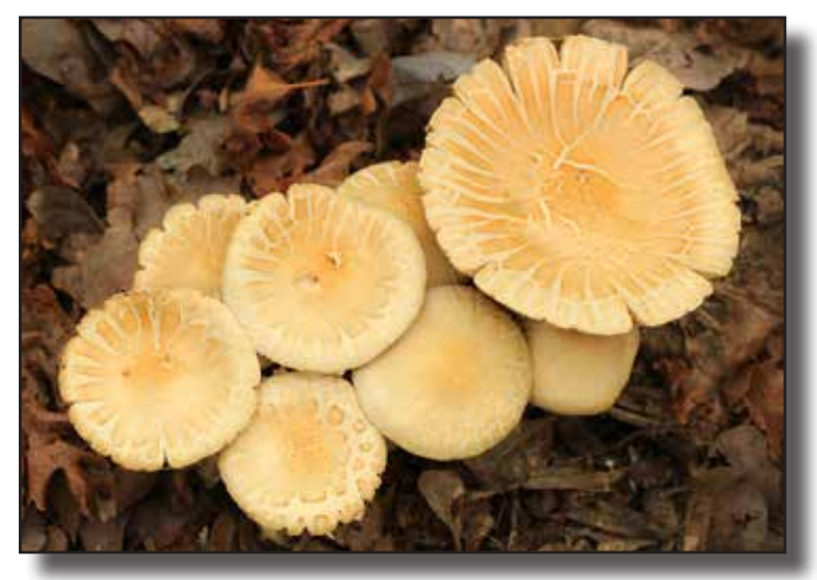
"Beautiful Patterns on Mushroom Cluster" by Peggy Seale