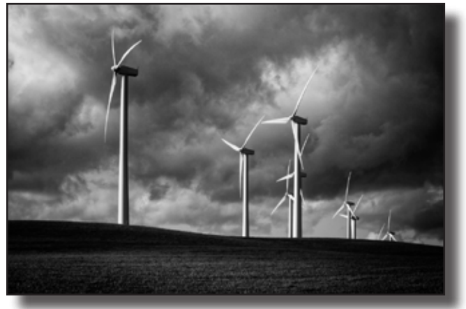
"The Changing Landscape" by Jan Lightfoot