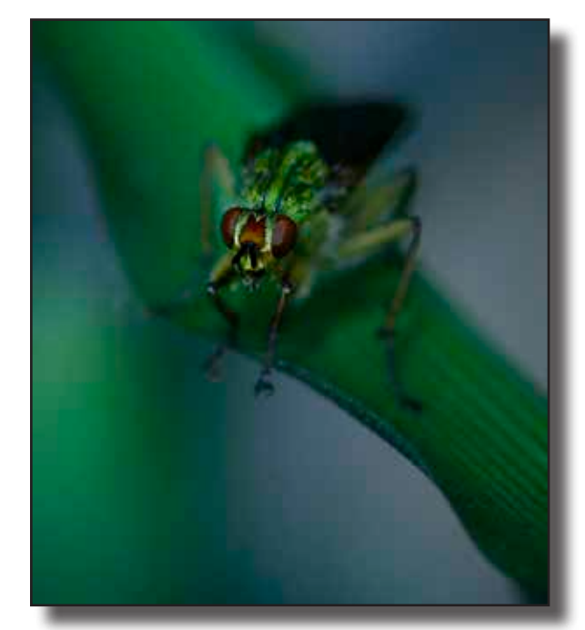
"Fly Eyes" by Peggy Seale