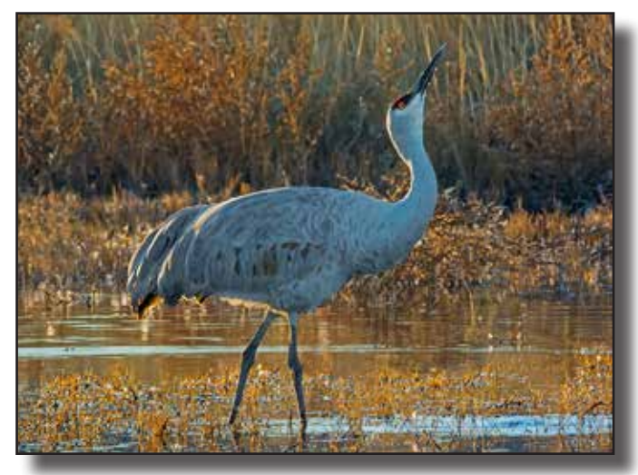
"Last Sip of Water" by Julius Kovatch