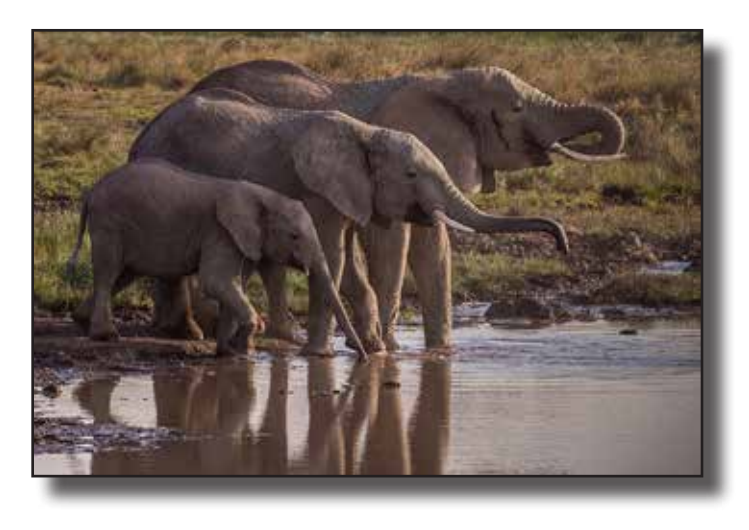
"Ndutu Elephant family at Waterhole" by Lynne Anzelc