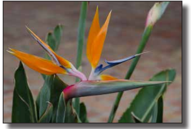
"Eye of Bird of Paradise" by Joe Balestrini