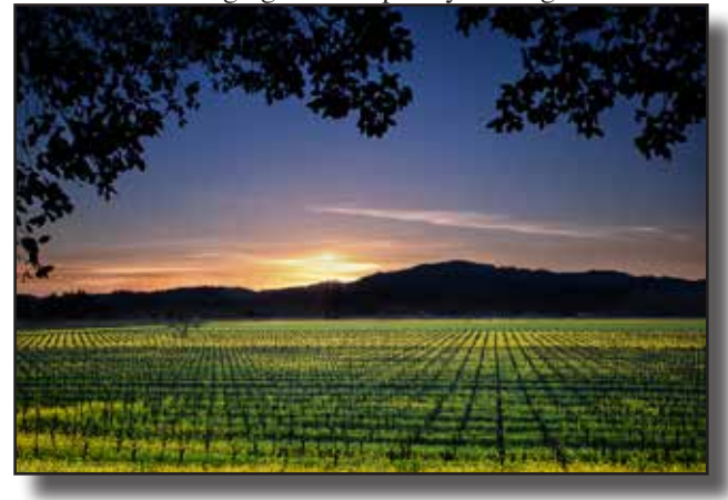
"Mustard in the Wine Country" by Cheryl Glackin