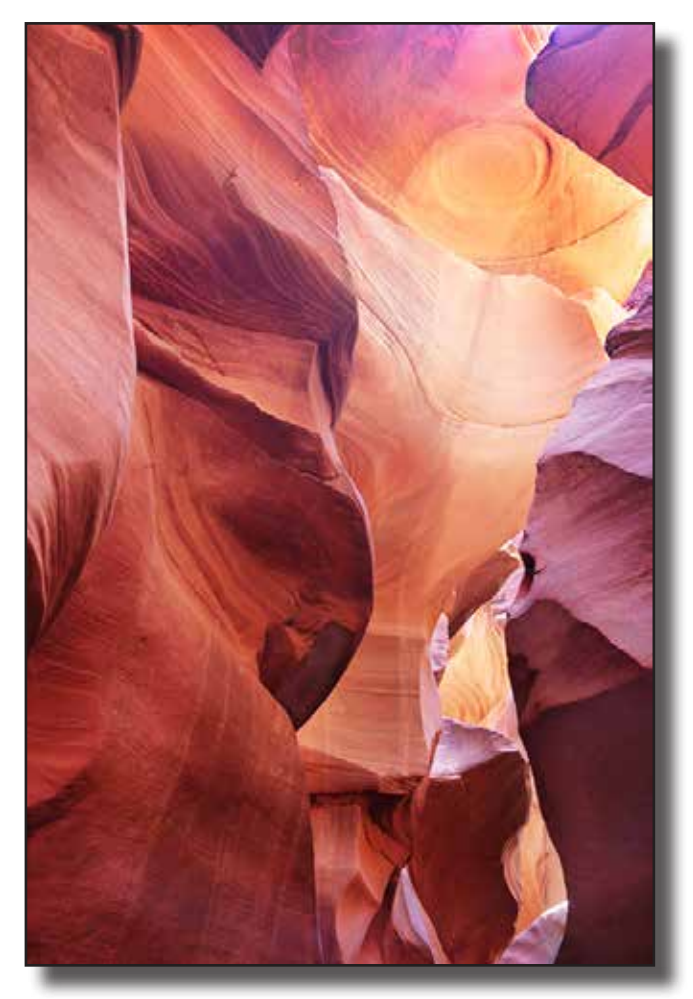
"Navajo Sandstone Eroded to Form Slot Canyon" by Dave Kent