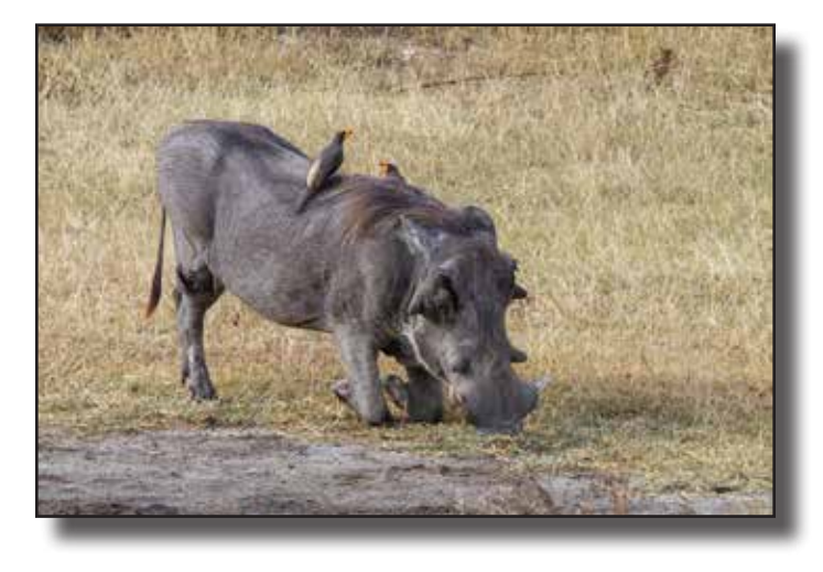
"Tanzania Warthog"