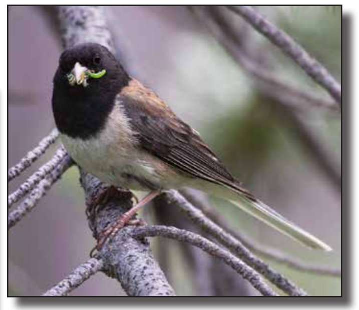
"Dark-eyed Junco with Food for Chicks"