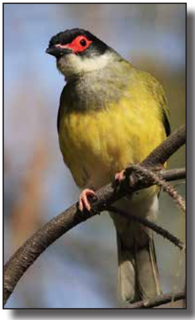
"Australian Figbird"