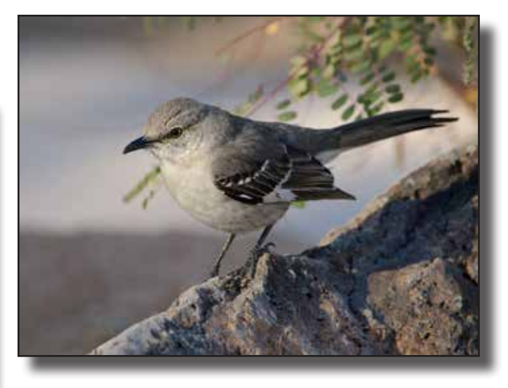
"Northern Mockingbird" by Werner Krueger