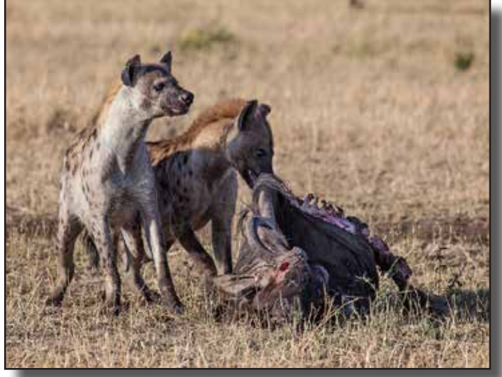
"Serengeti Hyaena with Water Buffalo Carcass" by Lynne Anzelc