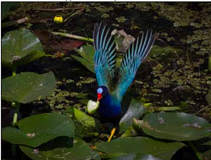
“Purple Gallinule Feeds on Lily Bloom” by Truman Holtzclaw