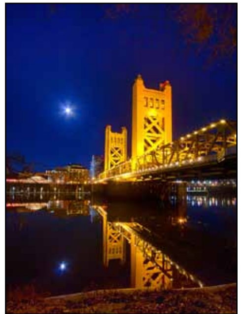
“Tower Bridge” by Gary Cawood