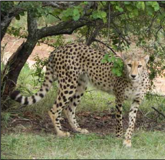
“Cheetah, DeWildt Reserve, South Africa” by Eugenia Gwathney