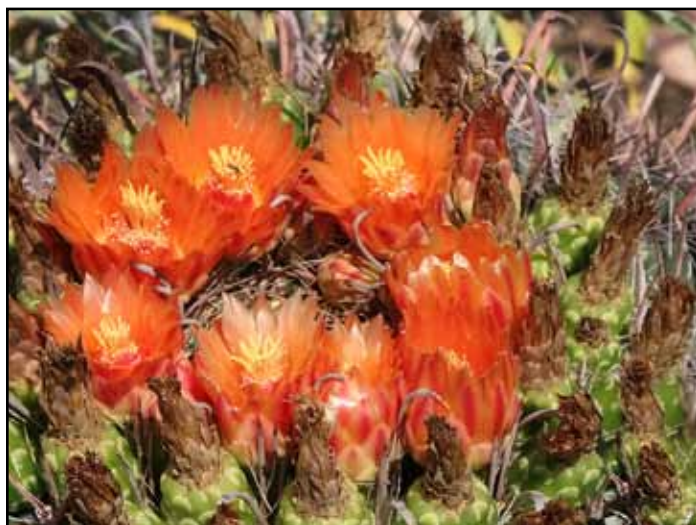
“Grasshopper on Barrel Cactus”