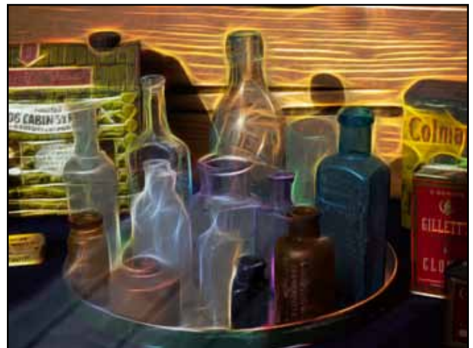
“Old Bottles” by Donna Sturla