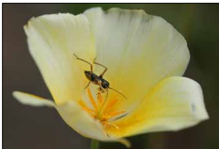
“Cricket Eating Pollen from Poppy” by Peggy Seale