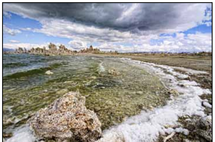
“Windy Day at Mono Lake” by Peggy Seale