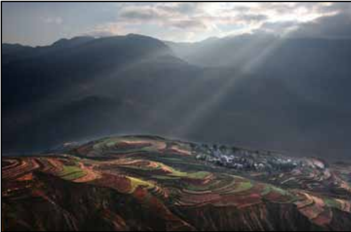
“Terraced Crops Near Hilltop Village” by Willis Price