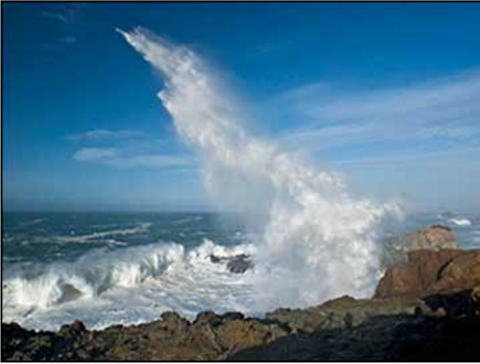
“Big Surf Duncan’s Point” by Donn Reiners