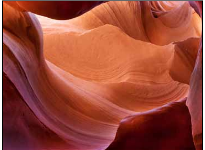
“Lower Slot Canyon” by Gay Kent