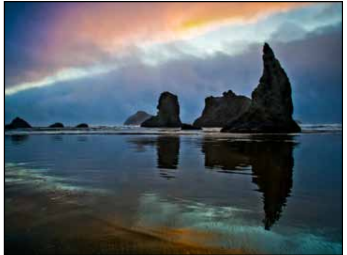
“Bandon Oregon Sunset”