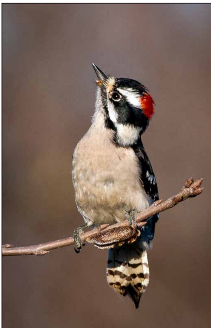
“Downy Woodpecker Looking for Acorns” by Jan Lightfoot