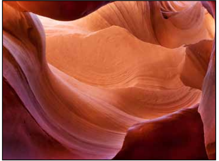
“Lower Slot Canyon” by Gay Kent