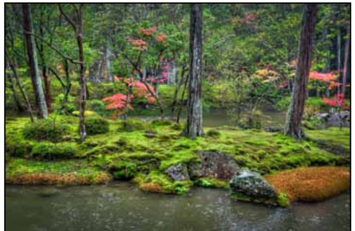
“Moss Forest Kyoto Japan”