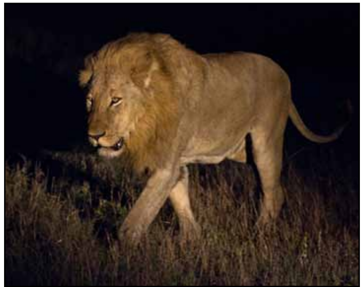
“Old, Tired Lion on the Prowl, South Africa” by Theo Goodwin