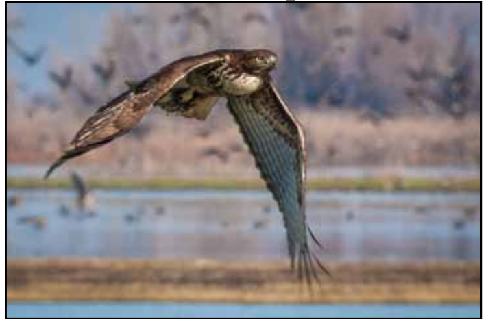
“Red Tail Hawk in Flight” by Jan Lightfoot