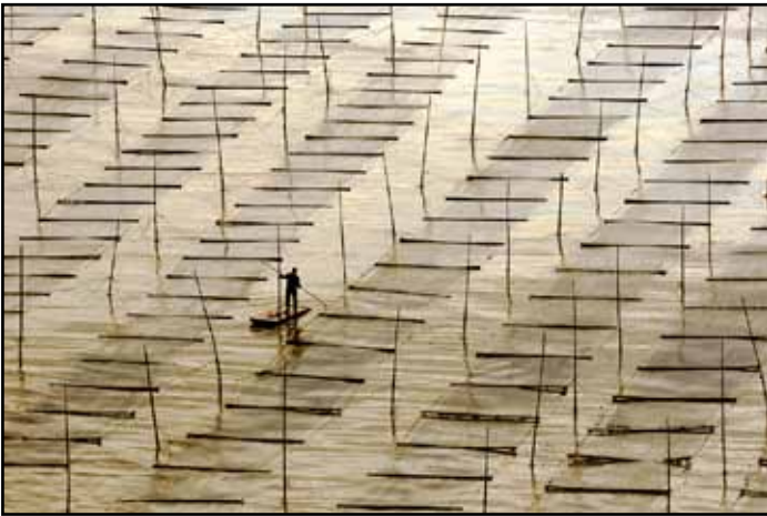
“Seaweed Crop Tender” by Willis Price