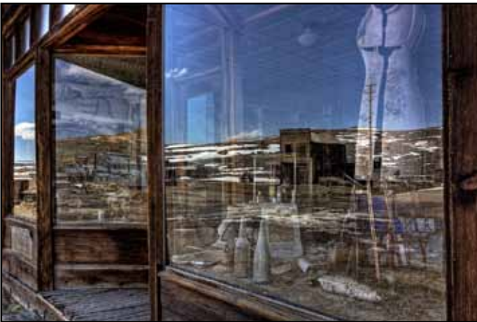
“Bodie Reflection” by Lynne Anzelc