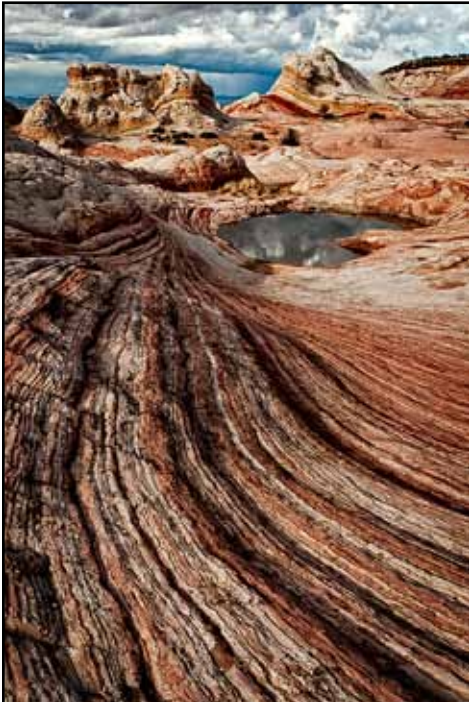
“White Pocket Reflection” by Ron Parker