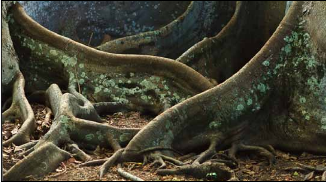
“Moreton Bay Fig Trees, Kauai” by Theo Goodwin