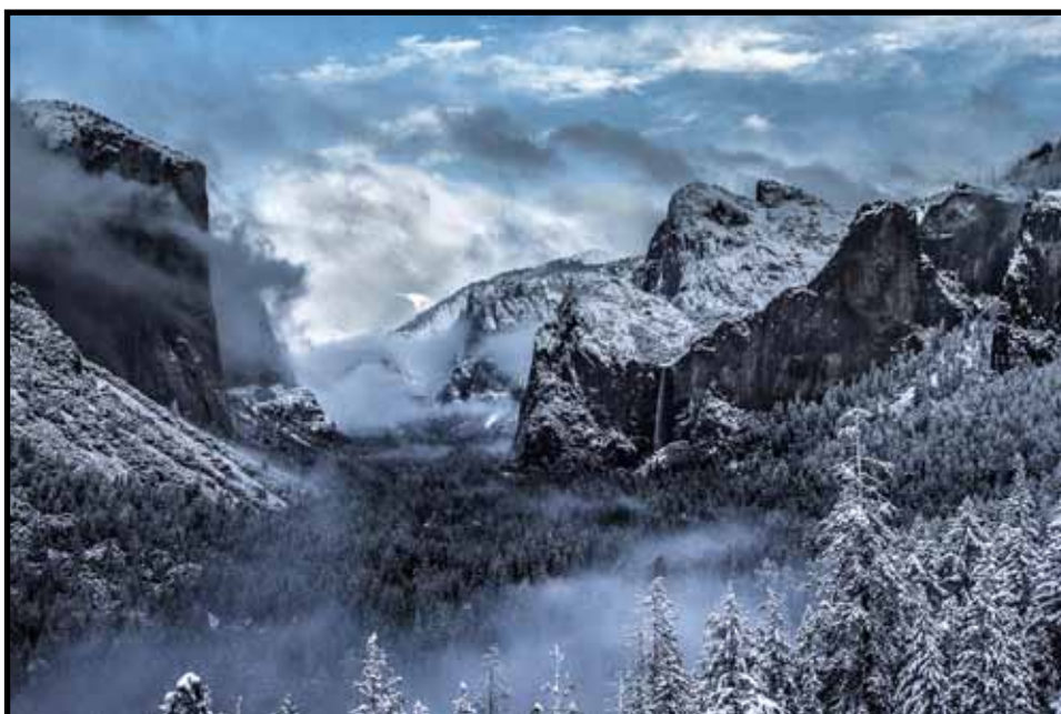
General Photography Image of the Night