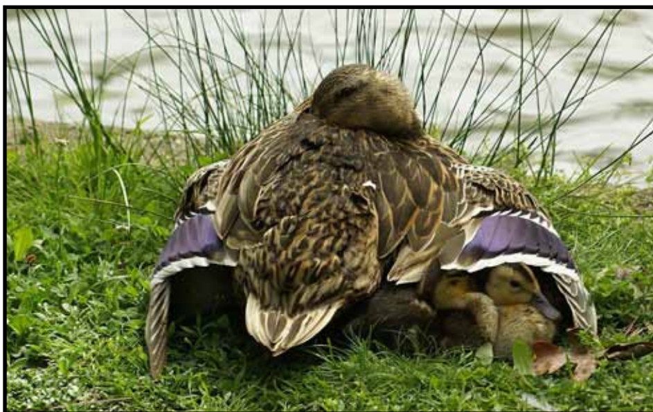
Nature Image of the Night

Volume 75 Number 5 * May 2012 * www.sierracameraclub.com