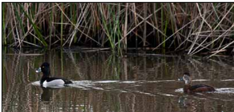
“Male & Female Ring Necked Ducks” by Dorothy Farol