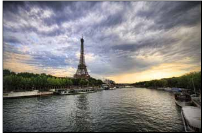
“Paris” by Peggy Seale