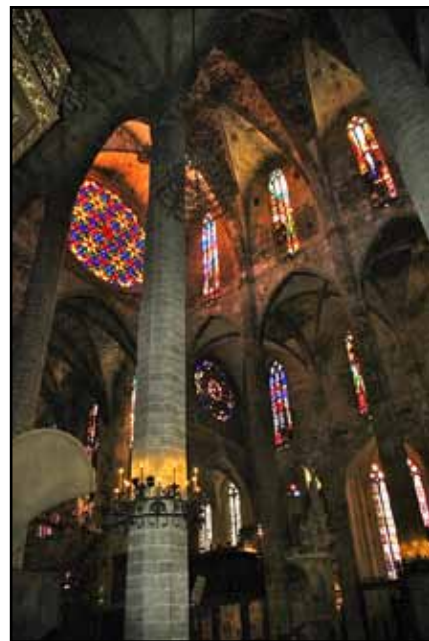
“Cathedral Windows Spain” by Marcia Sydor