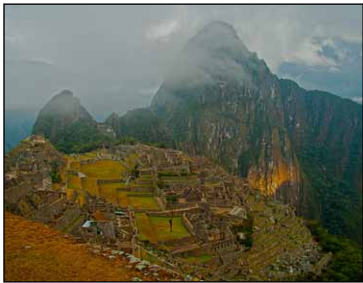
“Machu Picchu Sunrise”