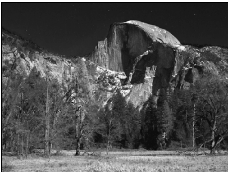
“Half Dome in Moonlight” by GariRae Gray