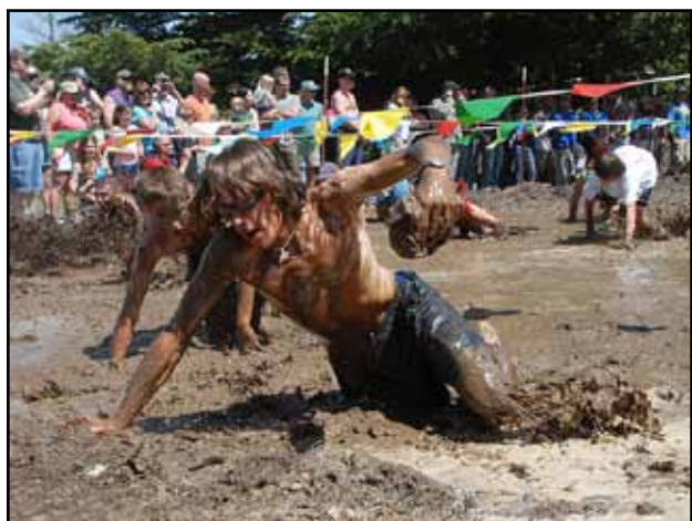
“Run Amuck Reno Race” by Willis Price