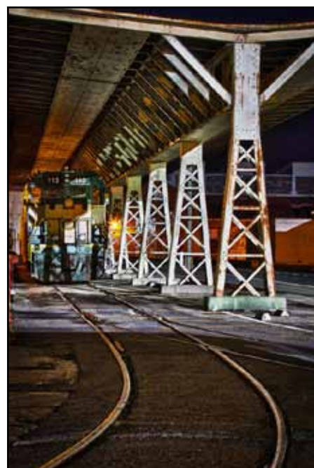
“Mare Island Station” by Jan Lightfoot