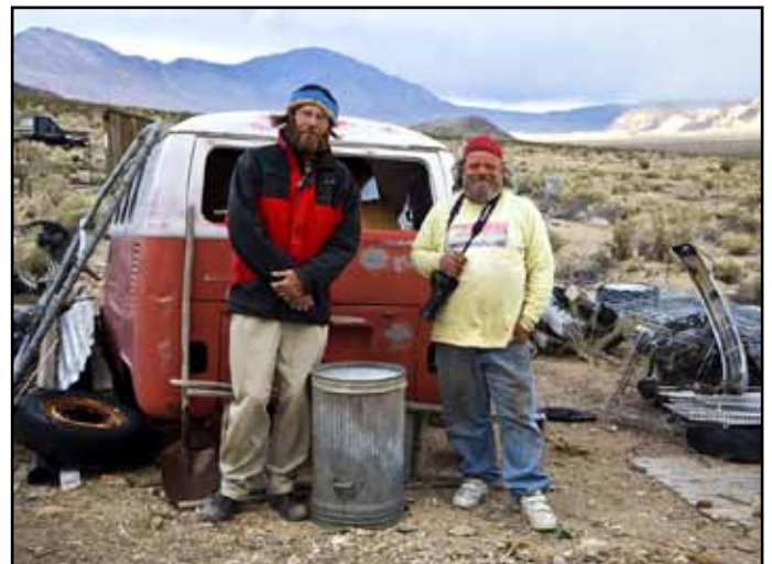
“Darwin Desert Inhabitants” by Truman Holtzclaw