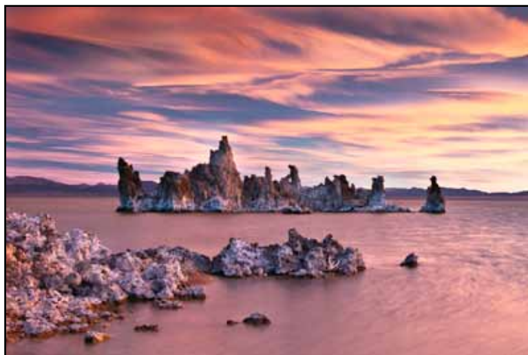
“Mono Lake Sunrise” by GariRae Gray