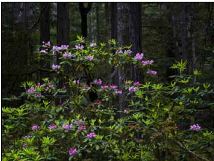
“Redwood Beauties” by Truman Holtzclaw