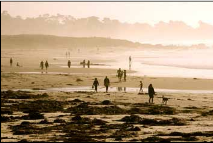
“A Day at the Beach” by Willis Price