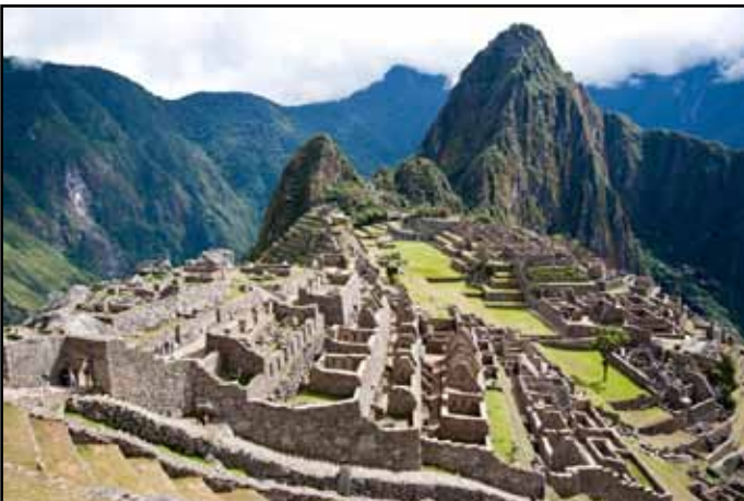
“Peru”