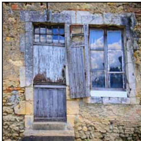
“Reflections, French Countryside” by Donna Sturla