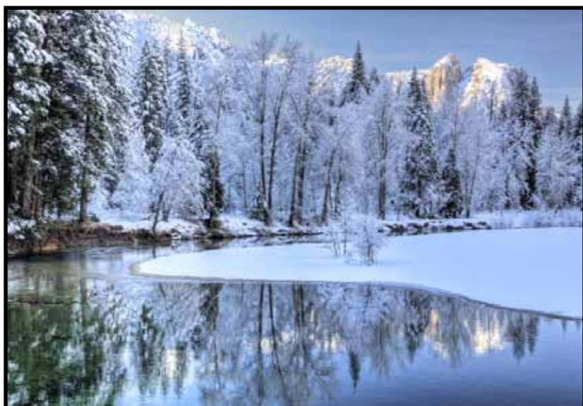
Travel Image of the Night "Yosemite Valley Floor in Winter" by Lynne Anzelc

Volume 75 Number 4 * April 2012 * www.sierracameraclub.com