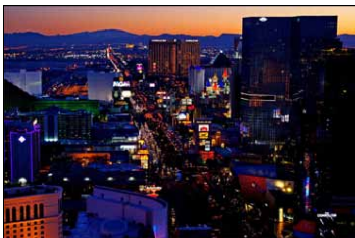
“Top of the Eiffel Tower in Vegas at Twilight” by Jeanne Snyder