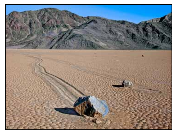
"Mysterious Plowing Rocks, Death Valley" by Truman Holtzclaw