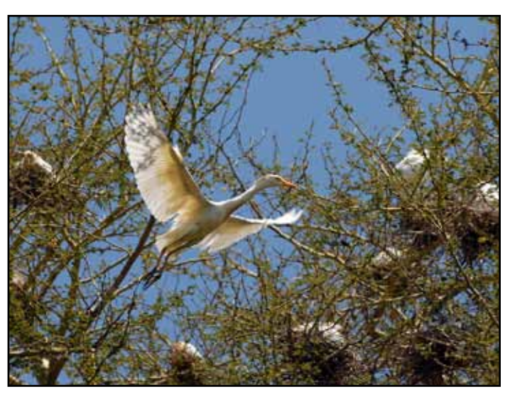
"Egret Bringing Twigs for Nest" by Willis Price