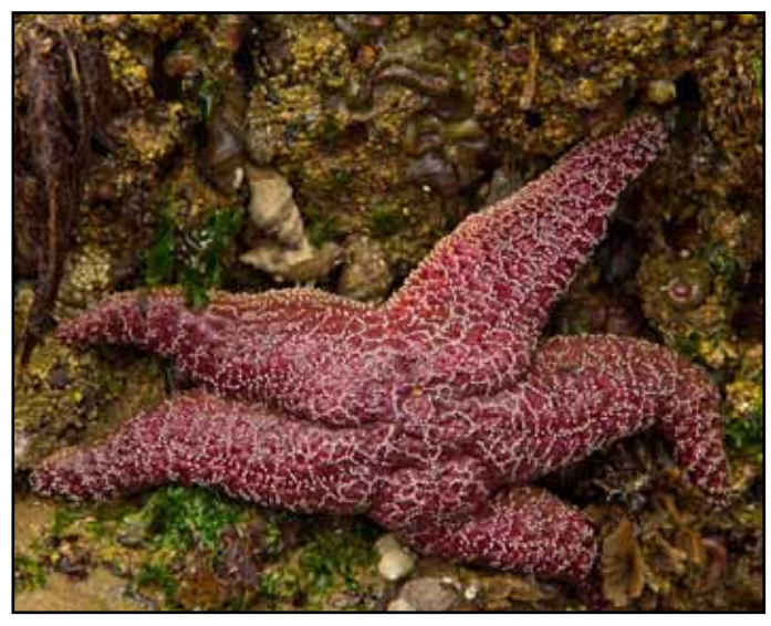
"Reaching Sea Star, Canon Beach, Oregon" by Theo Goodwin