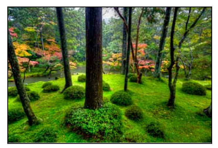
"Mossy Temple Forest, Kyoto"