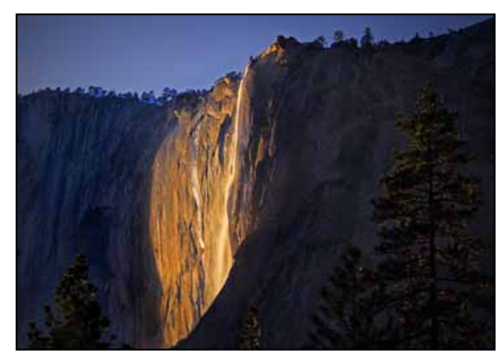
"Yosemite Firefall" by Peggy Seale