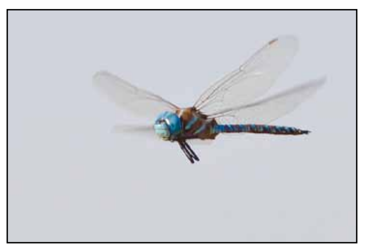
"Dragonfly in Flight" by Jan Lightfoot