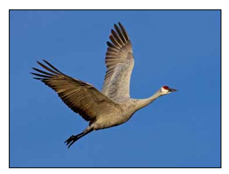
"Sandhill Crane in Bosque" Julius Kovatch