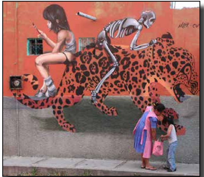
"Girl and Mother Preparing for Day of the Dead, Mexico" by Theo Goodwin