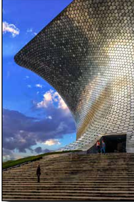
"Soumaya Museum, Mexico City" by Gary Cawood