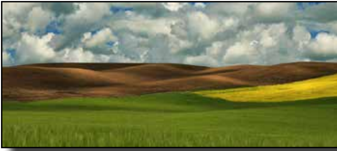
"Rolling Fields in Palouse Washington" by Peggy Seale