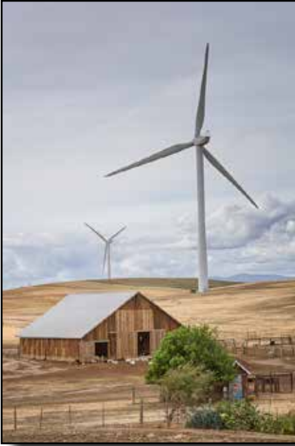
"Wind Turbines 2, Rio Vista" by Cheryl Glackin