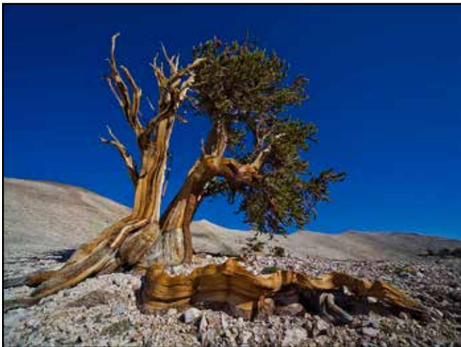
"Bristlecone Pine, White Mts"