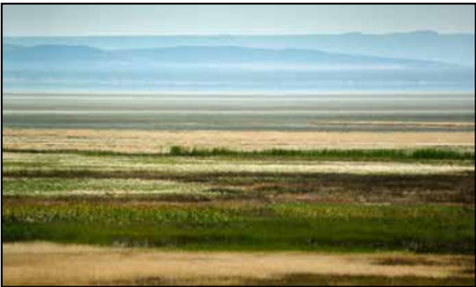
"Landscape Canvas, Lake County OR" by Barbara Maurizi