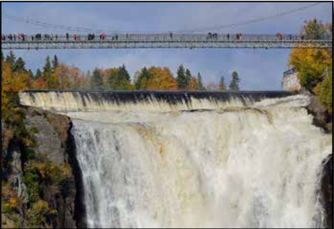
"Best View of Montmorency Falls, Quebec" by Joe Balestrini