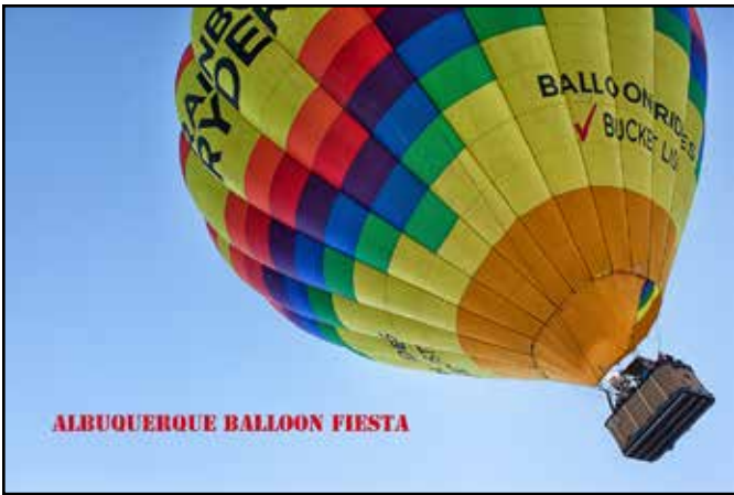
ALBUQUERQUE BALLOON FIESTA