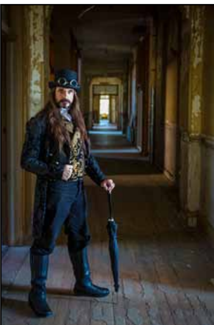
“Castle Explorer” by Truman Holtzclaw