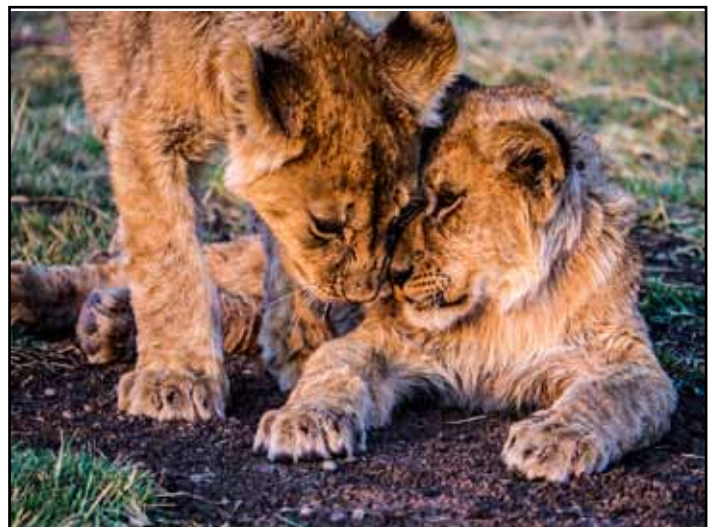
“Lion Family” by Chuck Pivetti