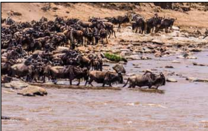
“Great Migration at Mara” by Chuck Pivetti