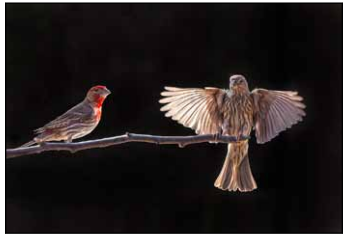
“Two Finches” by Don Goldman