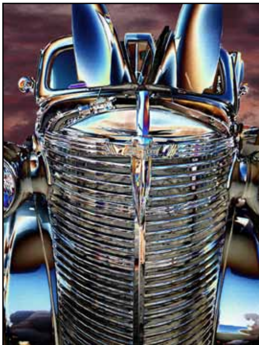
“Vintage Car Auburn Cruise Night”