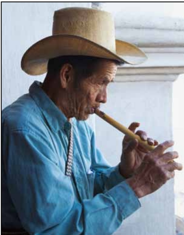
“Flutist” by Theo Goodwin