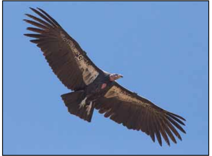
“California Condor 2”