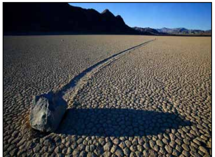
“What Is The Moving Force” by Truman Holtzclaw