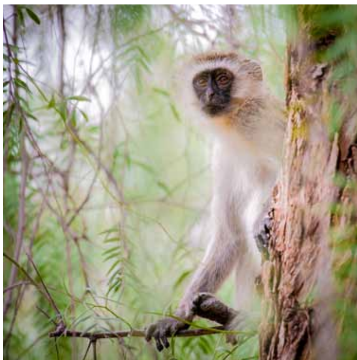
"Vervet Monkey in Tree"