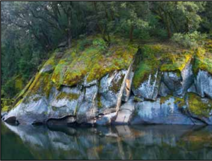
“Mokelumne River Along Hwy 26” by Sue Albright