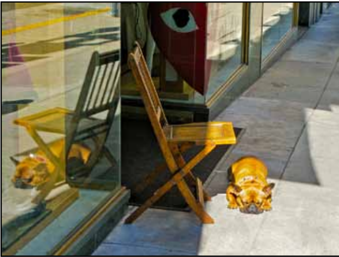
“Geary Street Watchdog” by Gary Cawood