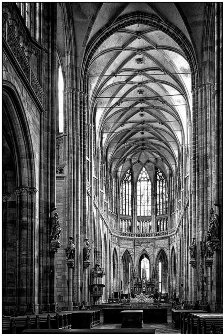
“St. Vitus Cathedral”