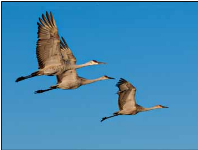
“Sandhill Cranes in Flight” by Julius Kovatch