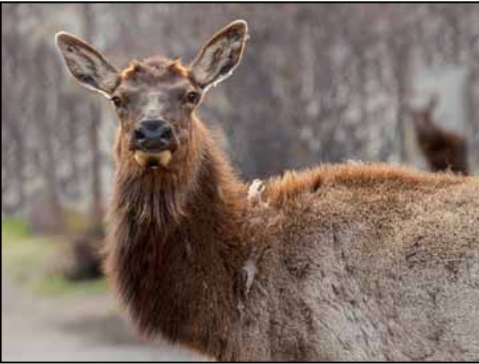
“Yellowstone Elk Watching Elk” by Lynne Anzelc