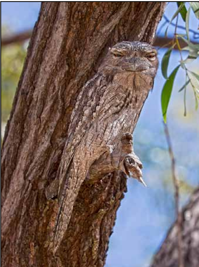
“Tawny Frogmouth Front Australia” by Don Goldman