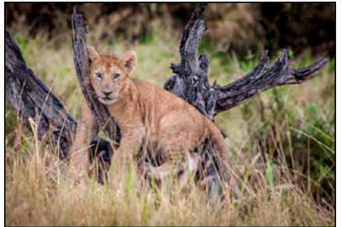
“Black Headed Oriole Nabs Insect, Kenya” by Jan Lightfoot