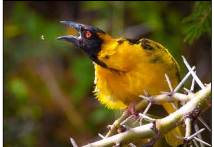
“Black Headed Oriole Nabs Insect, Kenya” by Jan Lightfoot