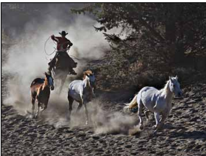
"Horse Drive in Dust" by Julius Kovatch