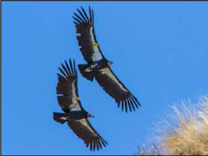
“California Condors”