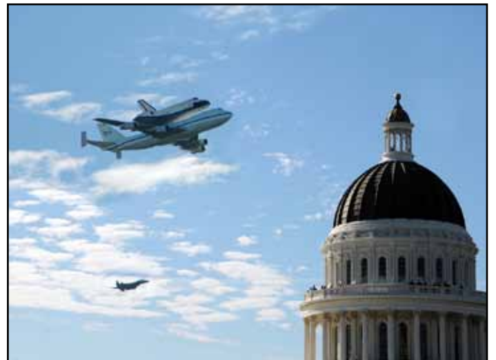
"Endeavour's Final Flight" by Willis Price