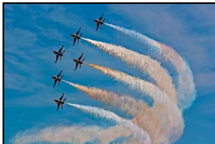
"Thunderbirds Heading Home"