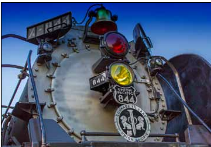
"Locomotive 844 Old Sac" by Don Goldman