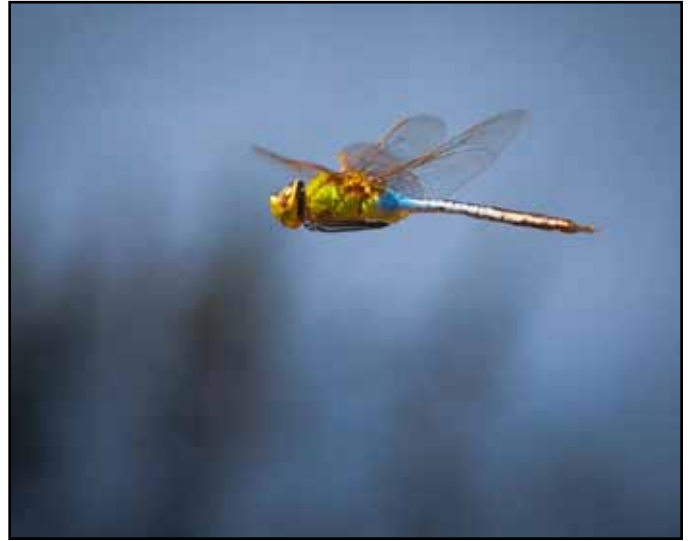
“Dragonfly Caught in Flight” by Jan Lightfoot