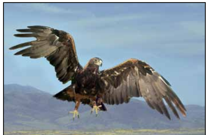
“Descending Golden Eagle” by Willis Price