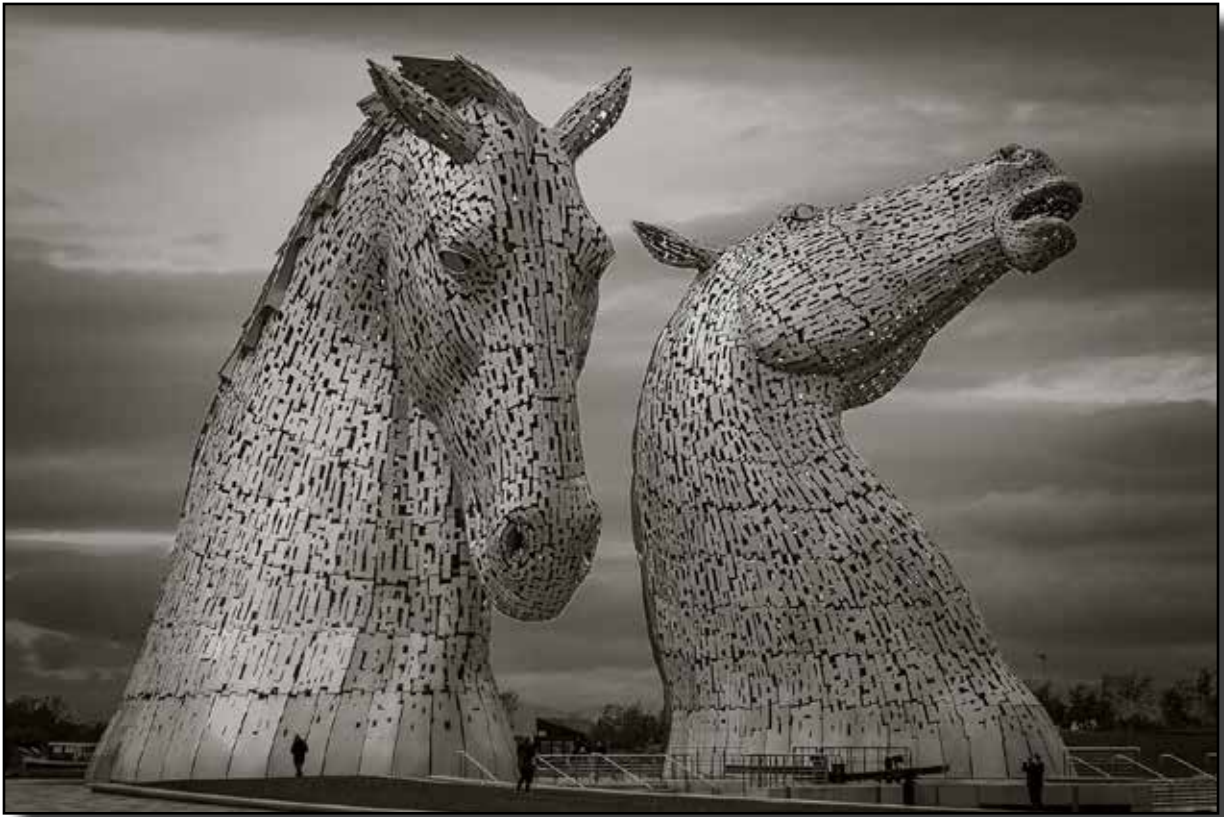
Monochrome: "Kelpies, Glasgow" by Don Goldman