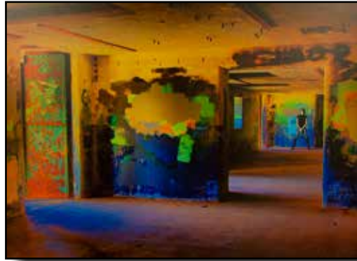
"Bunker Beauty" by Truman Holtzclaw