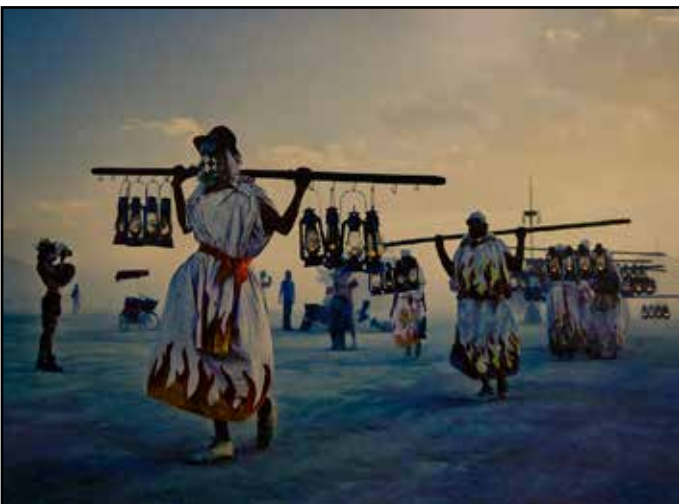
"Lamplighter" by Truman Holtzclaw