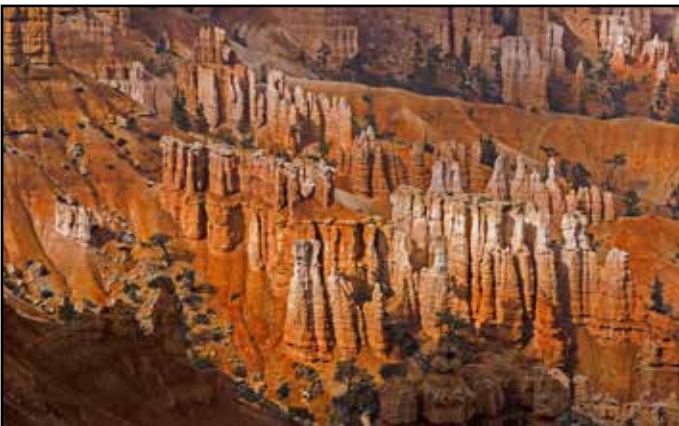
"Bryce Before Sunset" by Julius Kovatch