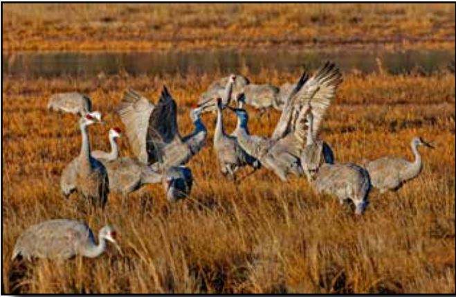
“Crane Fight with Referee” by Julius Kovatch