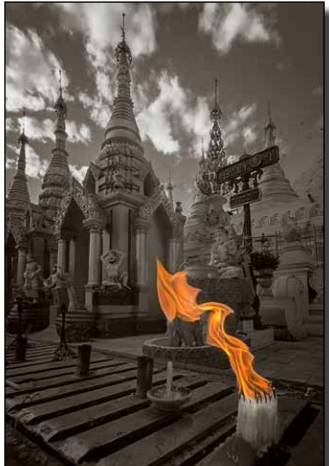
Color: "Schwedigon Flame, Myanmar" by Don Goldman