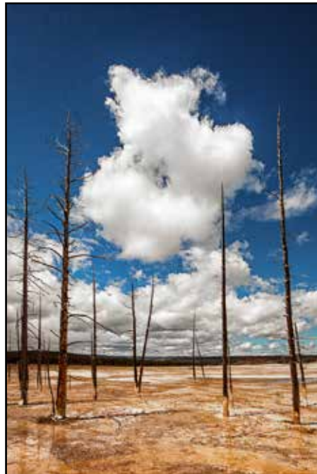
“Dead Trees in Thermal Landscape, Yellowstone” by Cheryl Glackin