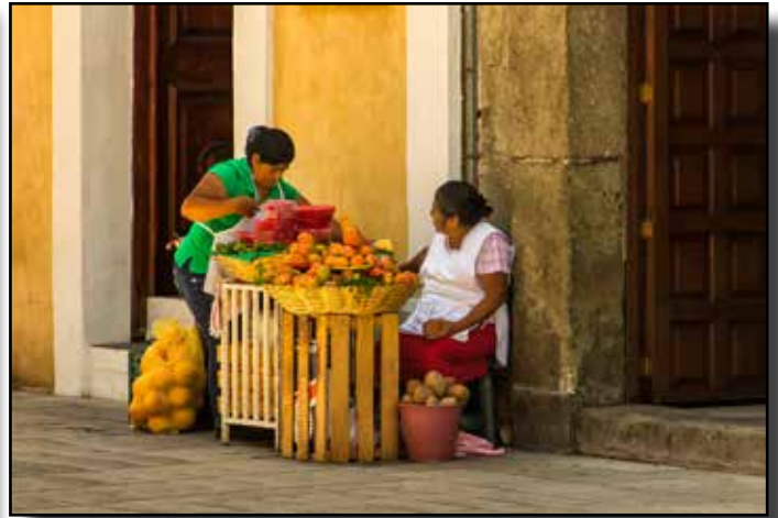
"Oaxaca Street Venders" by Gary Cawood