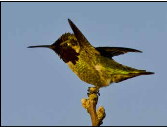
“Hummingbird Ready for Flight” by Donna Sturla