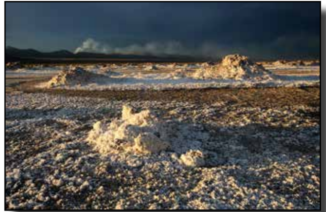
“Wildfire near Mono Lake Salt Flats” by Peggy McCaleb