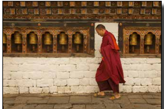
"Monk & Prayer Wheels, Paro"