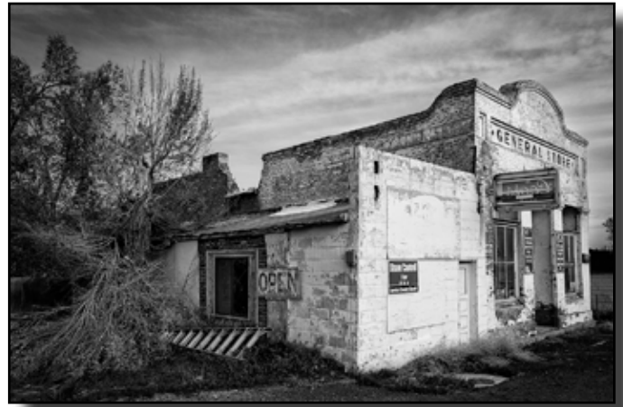
“General Store, Eureka, NV”