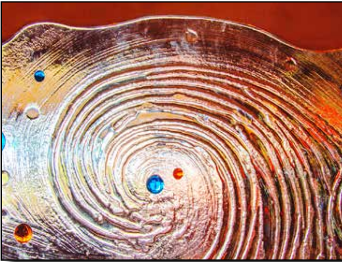
“Glass Swirl” by Gay Kent