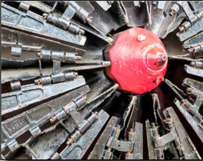
"White Pass Railroad Snowplow" by Werner Krueger