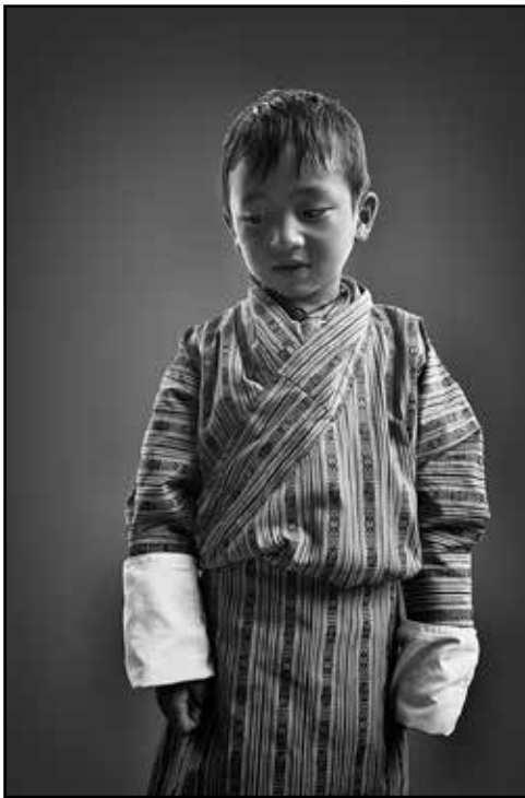
“Bhutanese Boy in Festival Dress” by Gary Cawood