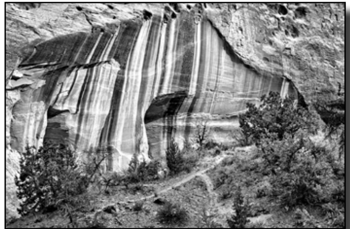
“Canyon Wall Patina, Escalante” by Ron Parker