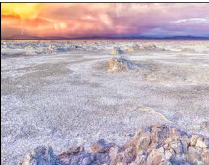
"Thunderstorm Near Mono Lake" by Cheryl Glackin