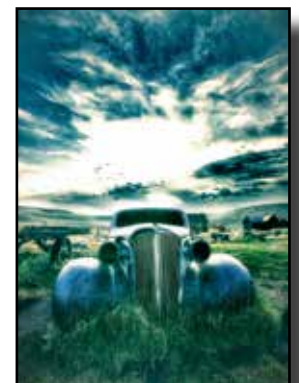
"Chevy Coupe, Bodie" by Cheryl Glackin