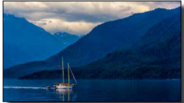
"Sailing the Canadian Inland Passage" by Gary Cawood