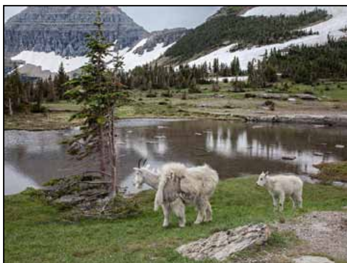
“Goats on Hidden Lake Trail in Glacier” by Lynne Anzenc