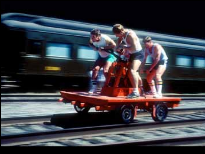
“Rail Fair Racers” by Willis Price