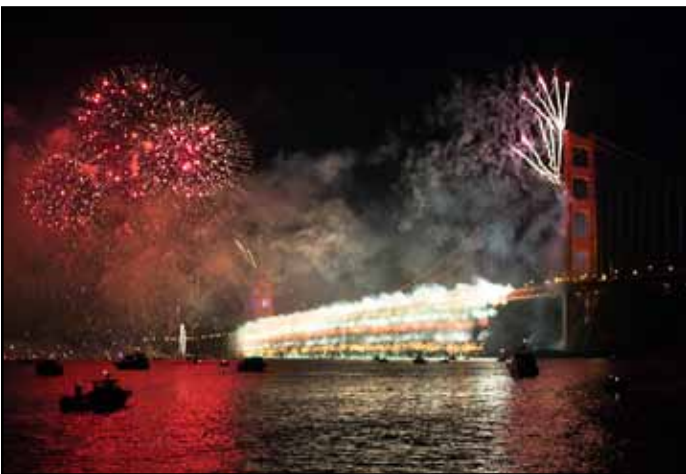
“Golden Gate 75th Anniversary”