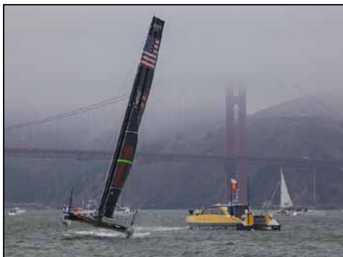
“Americas Cup World Series in SF Bay” by Lynne Anzenc