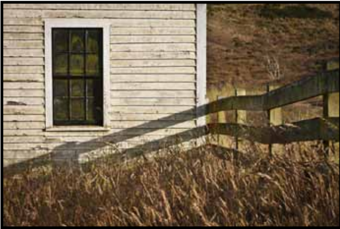
"Green Window" by Jan Lightfoot