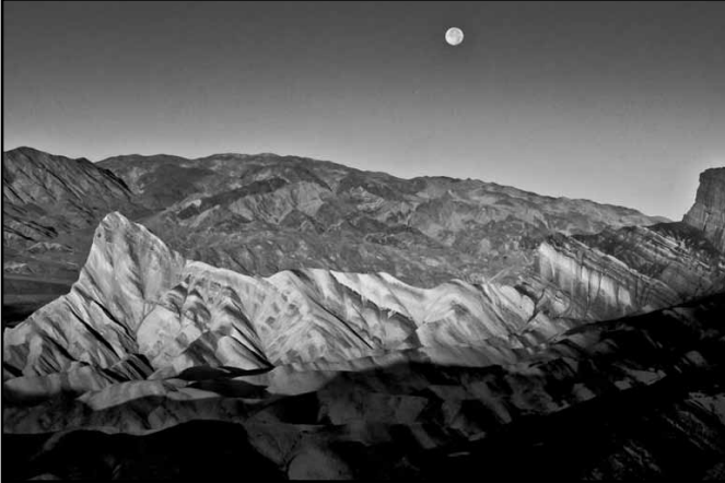
“Moonset, Zabriski Point”