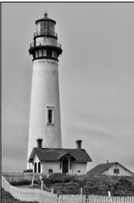
"Pigeon Point Lighthouse" by Werner Krueger