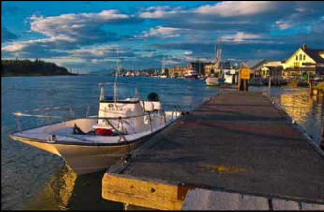
“La Conner Marina”