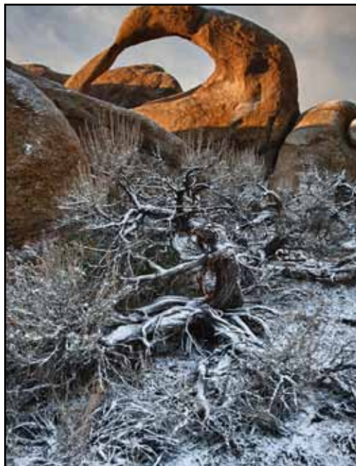
"Sunrie on Mobius Arch"