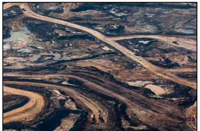
Photo of mining: Tar Sands Mining region in the Canadian boreal Forest. Note the contrast with the photo of the Canadian boreal forest that has not been mined. As the third largest and most carbon intensive oil reserves on the planet, the Alberta Tar mining is a global threat to climate stability and a sustainable, clean energy future.