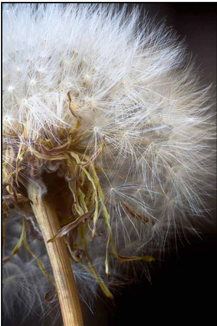
General Photography Image of the Night "Dandelion" by Lynne Anzelc

Volume 74 Number 9 * September 2011 * www.sierracameraclub.com