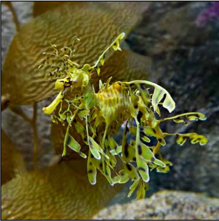
“Leafy Sea Dragon”