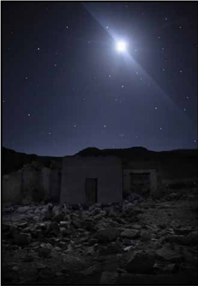
Lunar Flare by Peggy Seale