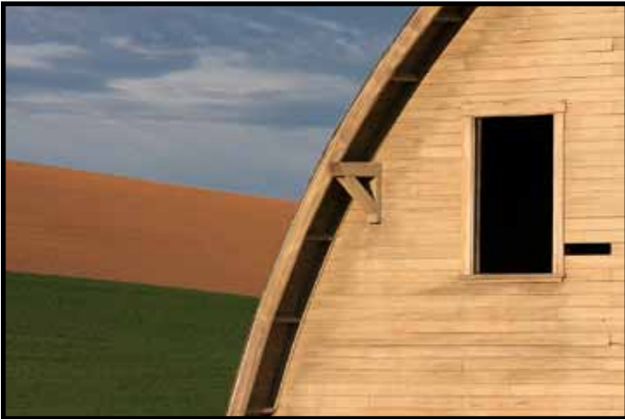
Palouse Profile