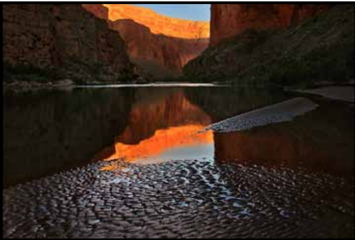
Grand Canyon by Gail Parris