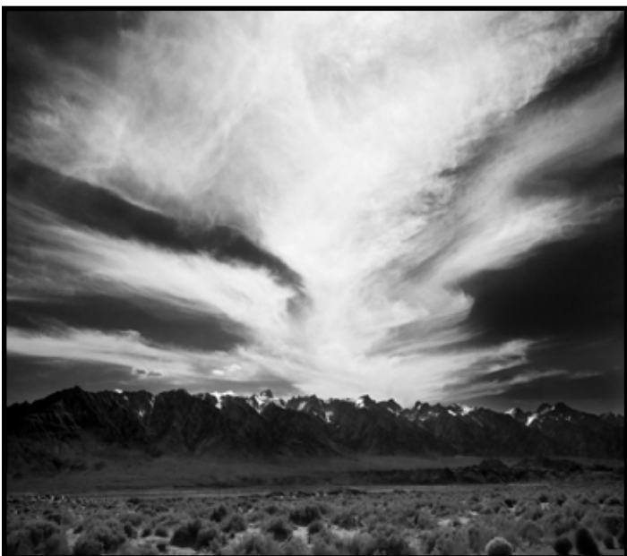
Eastern Sierra