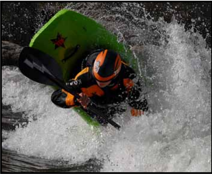
RiverFest 2010 by Willis Price