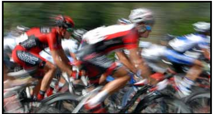
Amgen 2010 Grand Tour by Willis Price