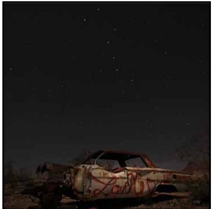
Abandoned Car by Peggy Seale