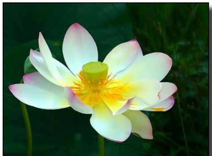
“Lotus in Watercolor” by Jeanne Snyder