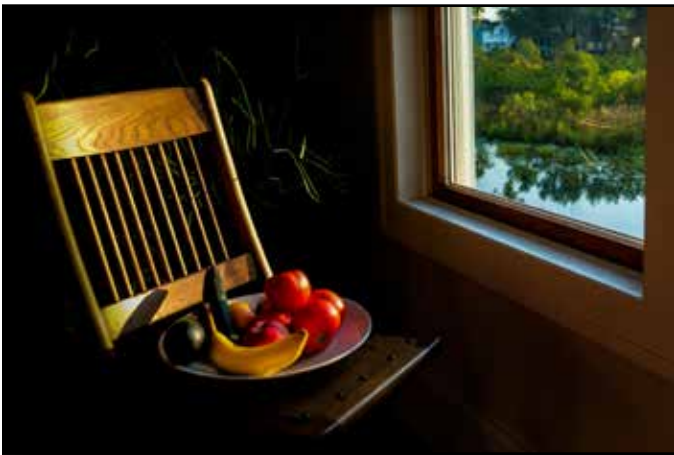
“Still Life Beside Lake” by Theo Goodman