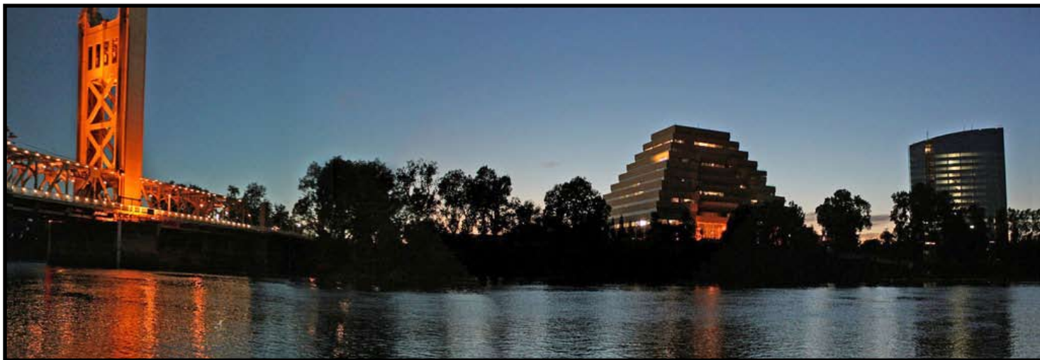
“Tower Bridge”