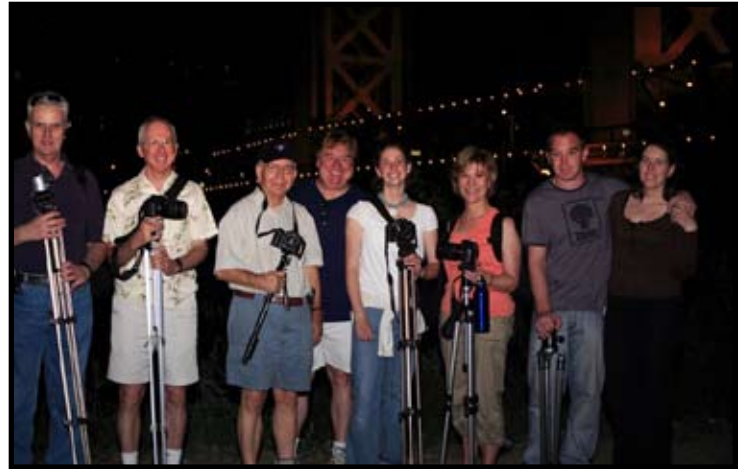
Some of the photographers on the Old Sacramento Field Trip