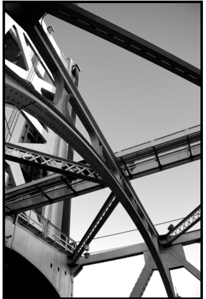
Tower Bridge