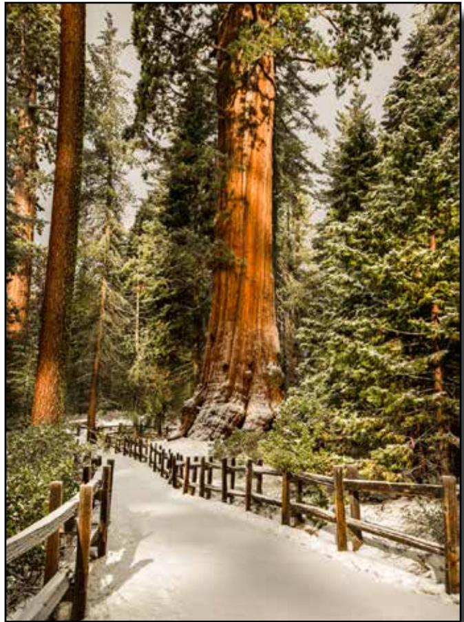
“Giant Sequoia”