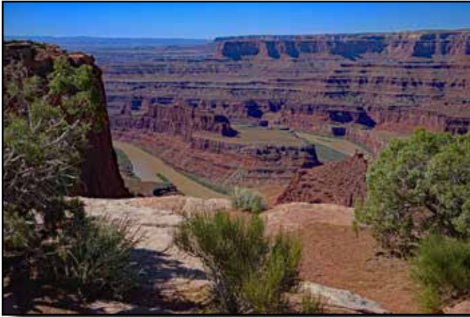
“Dead Horse Point, UT”