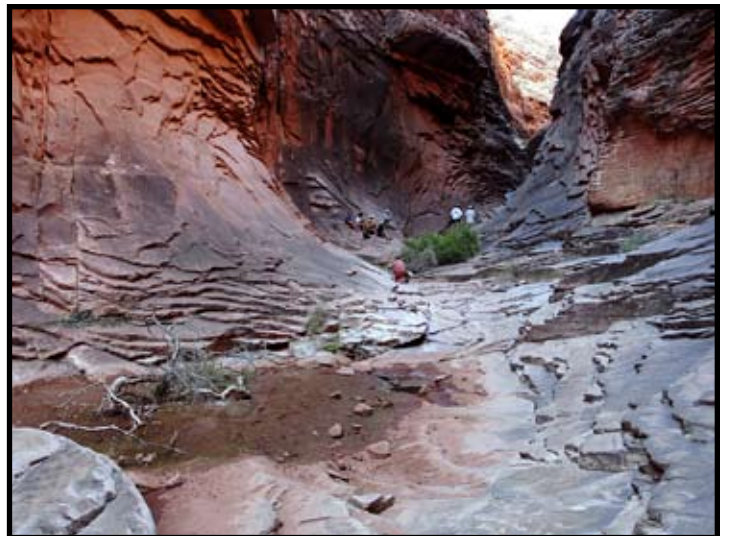
Side Canyon Trail