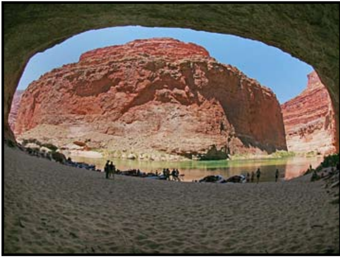
“Red Cavern Of The Grand Canyon” by Truman Holtzclaw