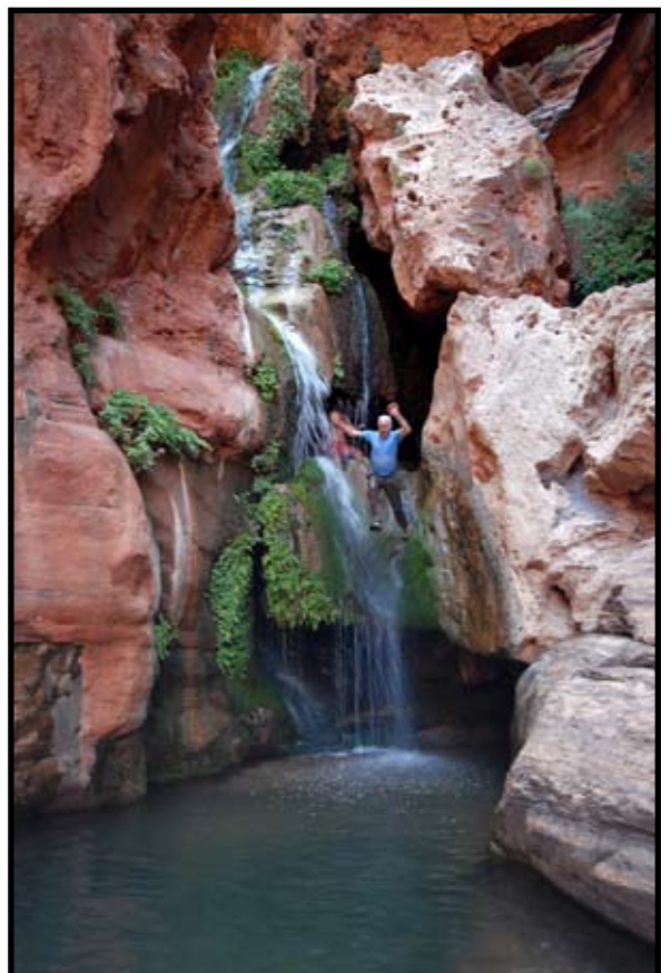
Glen Taking the Plunge