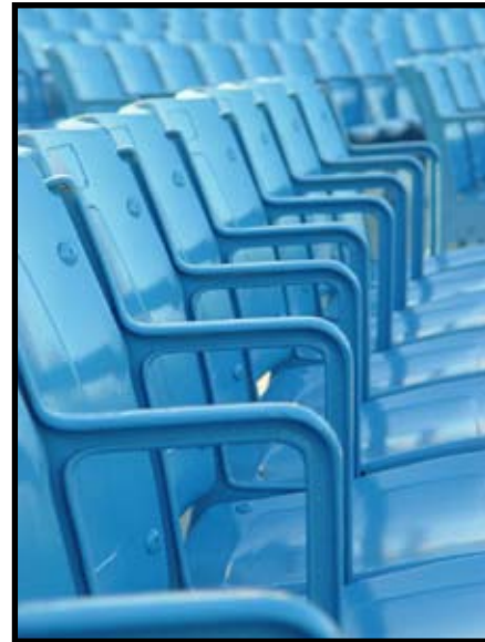
“The Audience” by Jeff Koertzen

Tip of the Month: In Levels: Don’t Click the White Balance Tool on Something White. The White Balance tool actually works best by clicking on something in your photo that is light gray, rather than clicking on something that is supposed to be white. If you are doing this in Camera Raw, once you’ve clicked on a light gray area, use the Tint and Temperature sliders if you want to tweak the white balance a little bit, but use the White Balance tool to do most of the work.