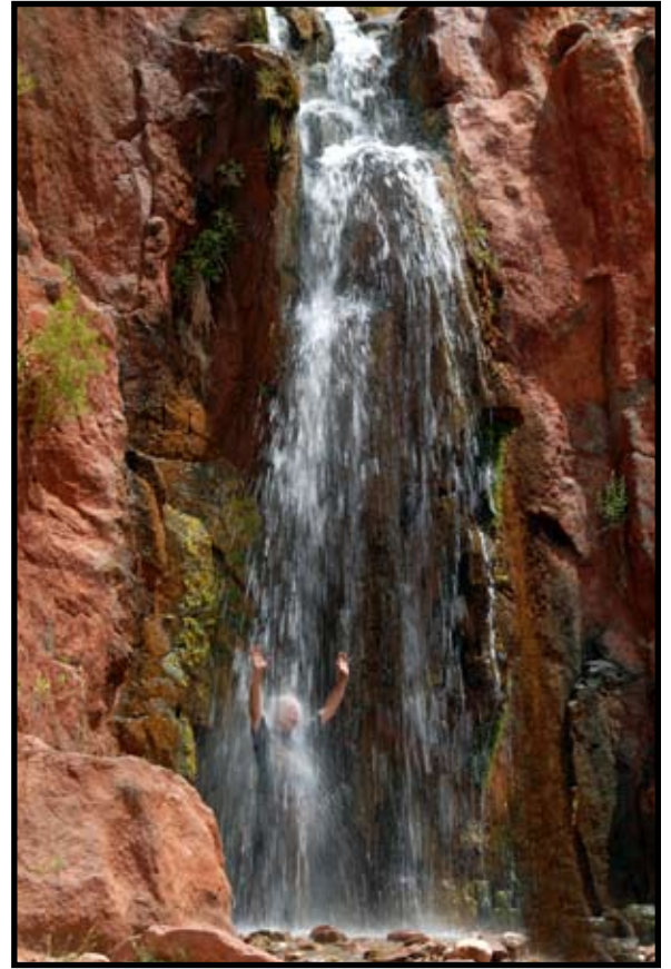
Truman in Waterfall