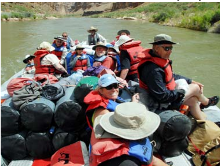
Crew of the Bright Angel

http://www.nationalgeographic.com/grandcanyon/NV_Entry.html