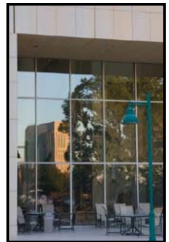
“Reflection of Old Sacramento” by Gay Kent