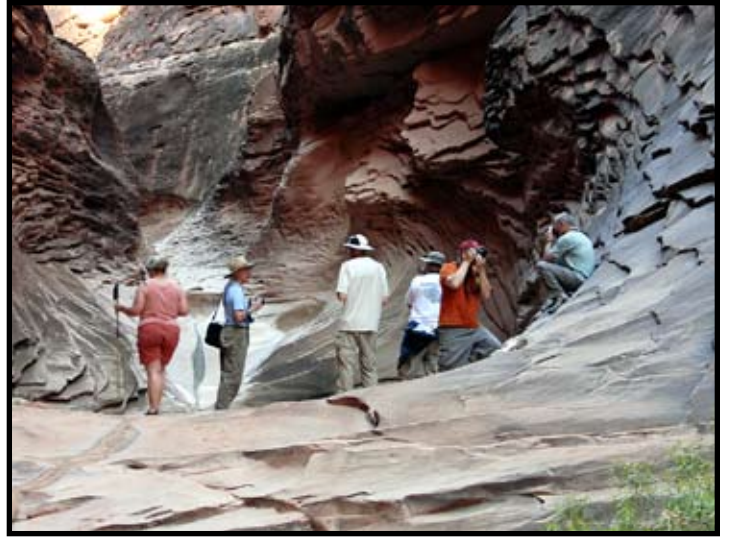
Disneyland for Photographers.