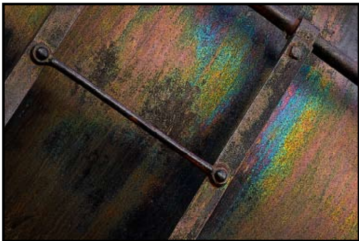
“Train, Old Sacramento Train Yard” by Heather Cline