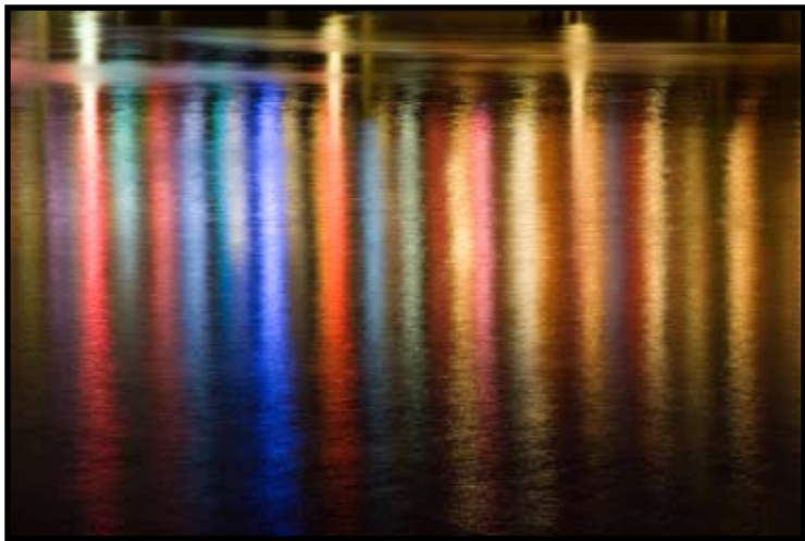
“Sacramento River Reflection” by Donna Sturla