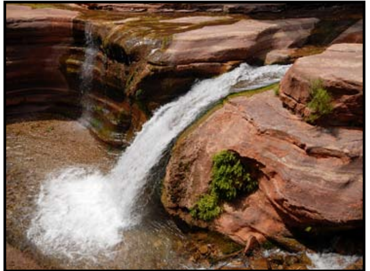
Side Canyon Hike