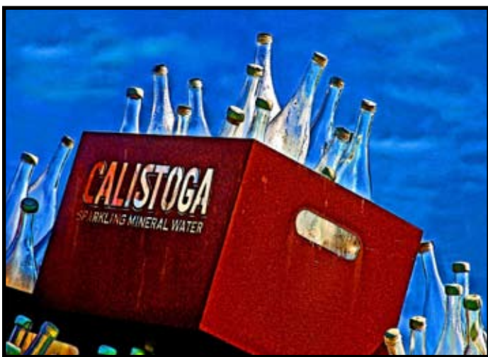
“Calistoga Water Bottles” by Chuck Pivetti