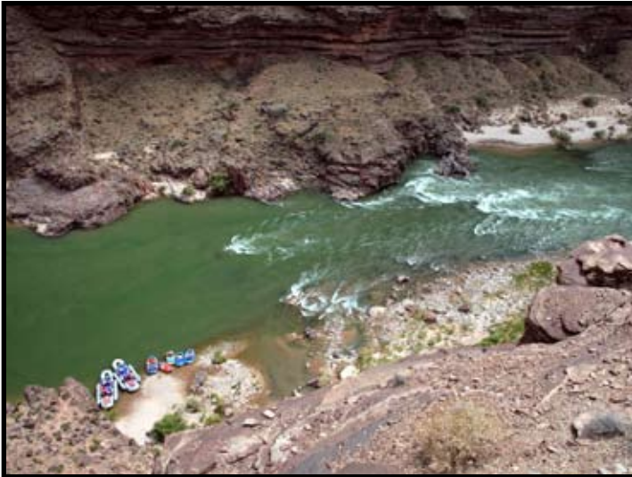
View From the Top