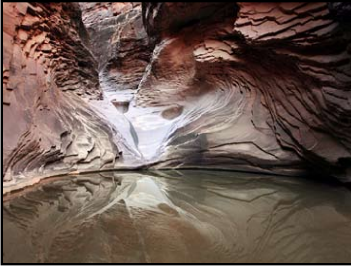
Side Canyon Trail