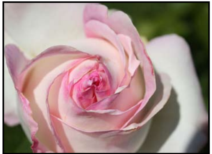
“Pink Flower” by Charlotte Cosulich