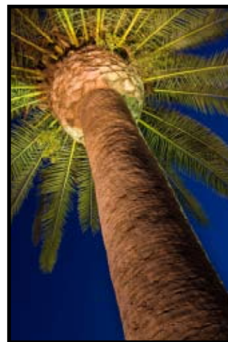
“Palm Tree, Embassy Suites Hotel”