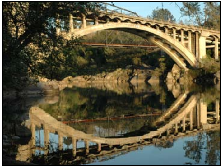
“Rainbow Bridge Reflection” by Donna Sturla