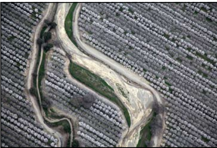
“Almond Tree with Bees” by Glen Cunningham