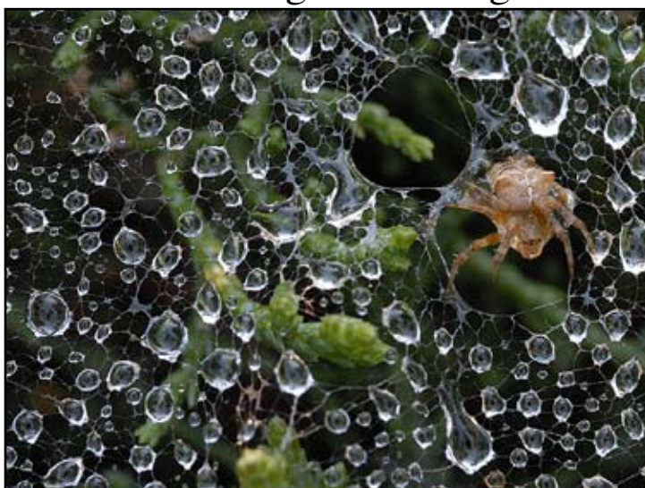
“Morning Dew” by Willis Price