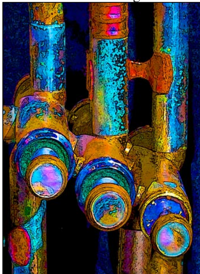
“Baritone Color” by Truman Holtzclaw