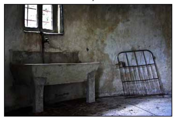
"The Pig Palace" by Jan Lightfoot