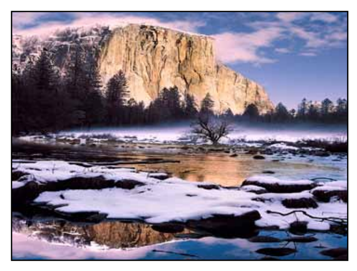
" Wide View of El Capitan" by Willis Price