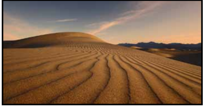
"Manzanita Dunes" by Peggy Seale