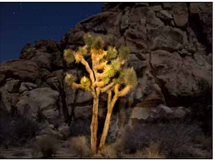
"Joshua Tree"