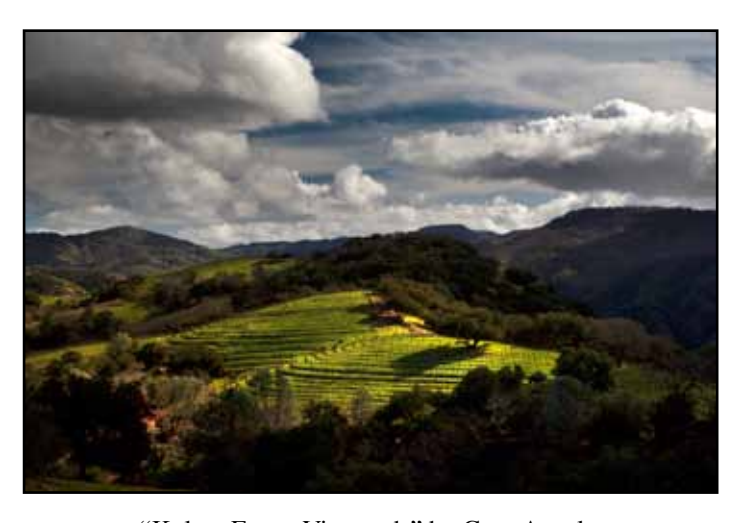
"Kuleto Estate Vineyards"