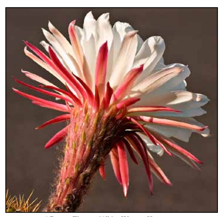
"Cactus Flower #1" by Warner Krueger