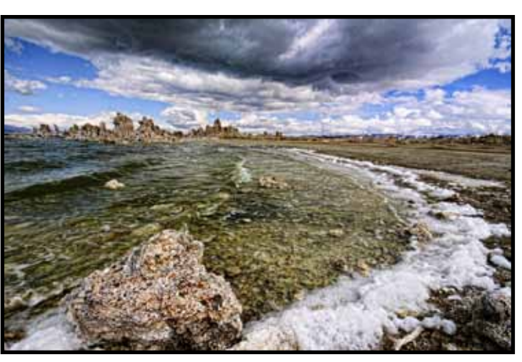
"Mono Lake Tufas" by Peggy Seale