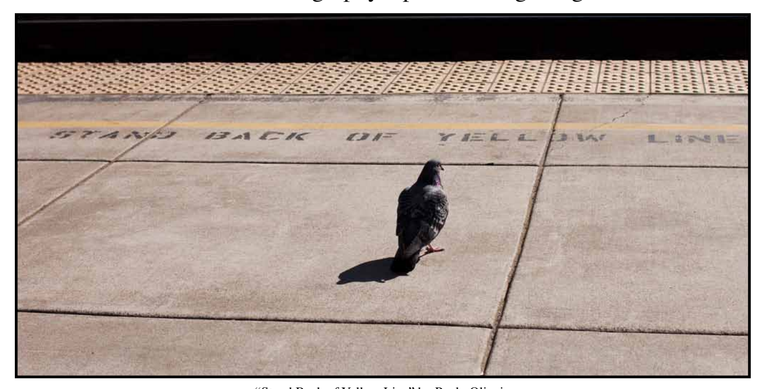
"Stand Back of Yellow Line" by Paulo Oliveira