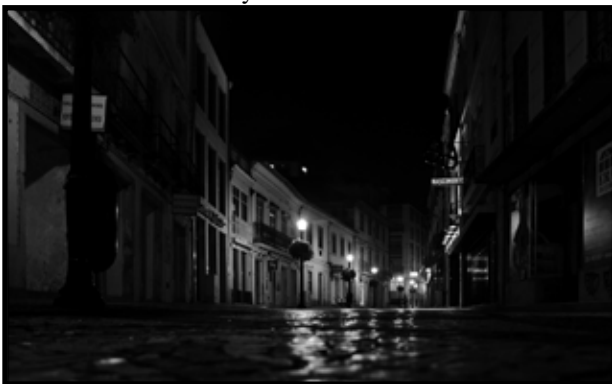
“Aveiro Street, Portugal”