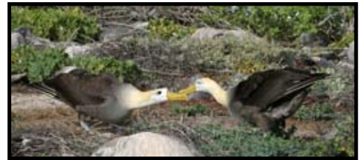
“Waved Albatross in Mating Display, Galapagos Islands” by Diane Hovey