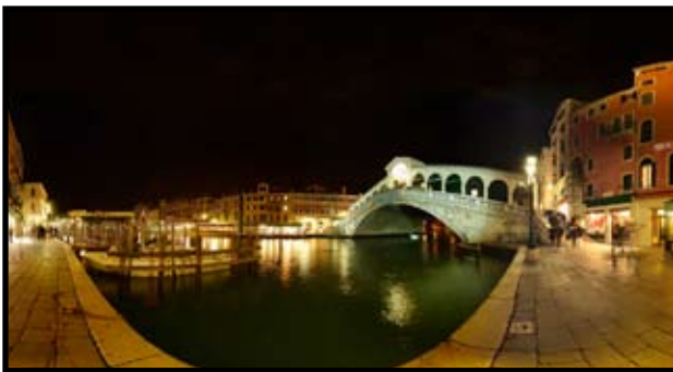
“Venice Rialto Bridge a” By Tommaso Esmanech