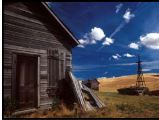
“Old House Palouse” By Jim Cehand