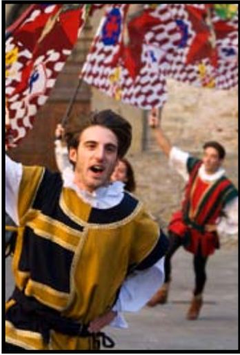
“Cortona Flag Throwers” By BJ Ueltzen