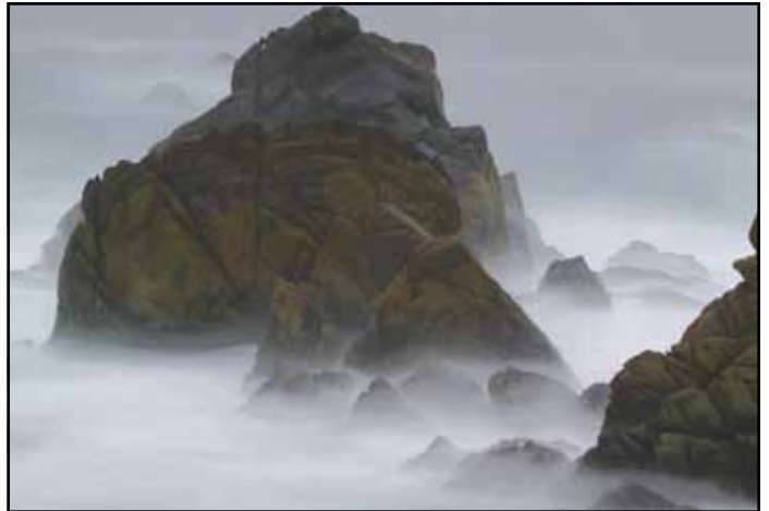
“Mystic Island” by David Grenier