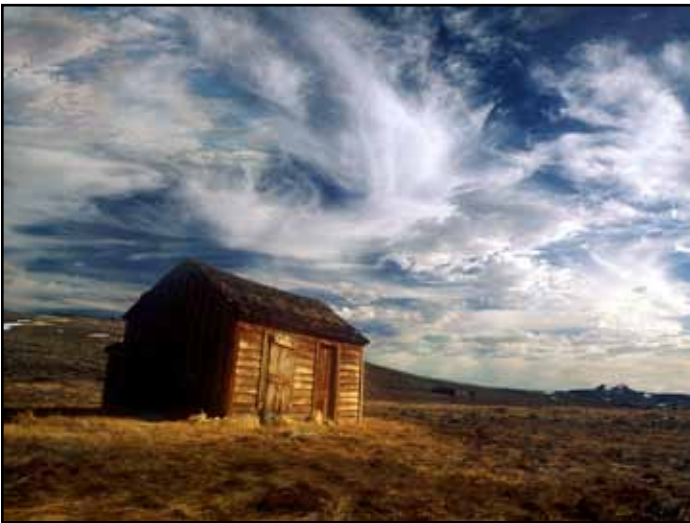
“Bodie Cabin” by Willis Price