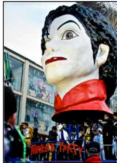
"Michael Jackson Thriller Float" Viareggio Carnevale