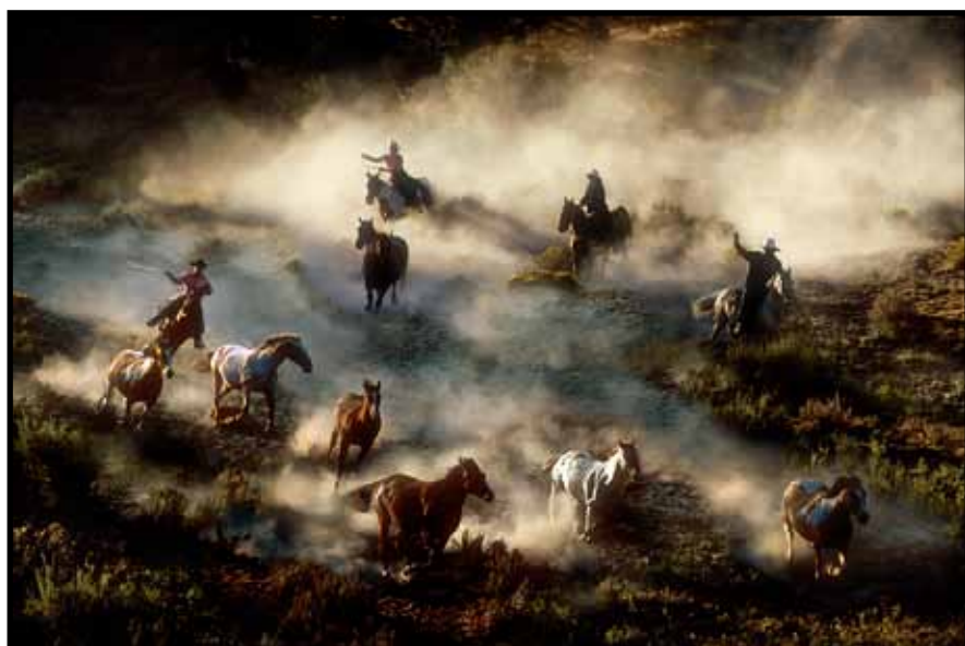
TRAVEL: "Horses and Dust" by Willis Price

Preston Castle Photographer's Day Saturday May 22. For tickets go to www.prestoncastle.com/photoday.html