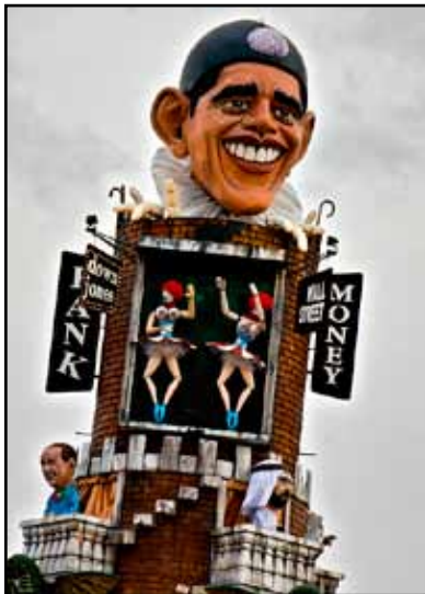
"Obama Pops Out of the Float" Viareggio Carnevale

This is my ninth year of coming here for a couple months at a time, and this historic city has become my second home. I have a wonderful rented flat with all of the conveniences (especially an oven, washer and wi-fi). Now all my neighbors and the vendors at the open market nearby recognize me and welcome me back.