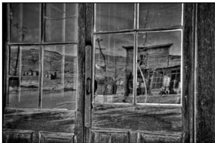
“Bodie Window Reflection” by Ron Larsen