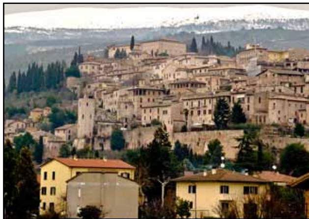
"Snow on Monte Subasio" Spello