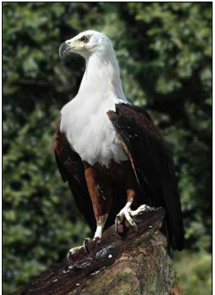
“African Fish Eagle” by Willis Price