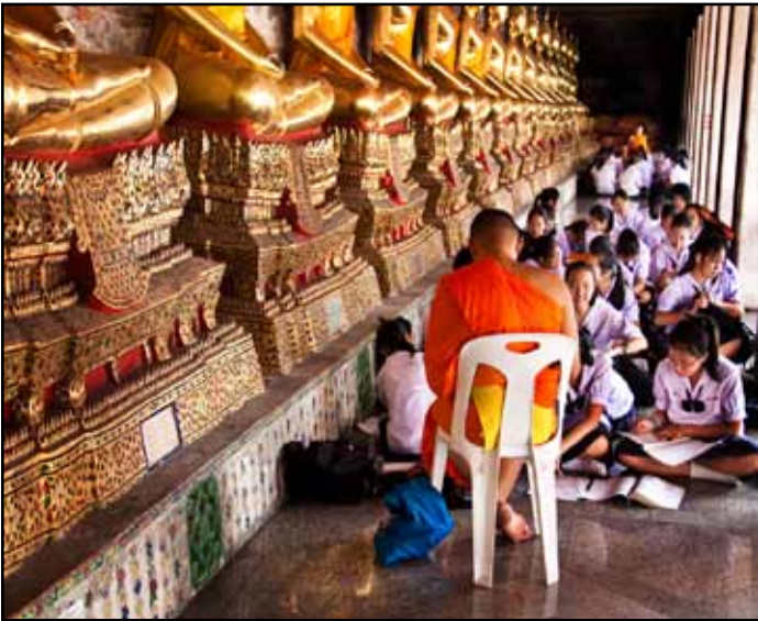
“Thai Kids get Buddhist Lessons”