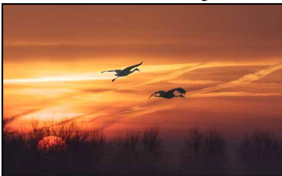
NATURE: "Sandhill Cranes Take Flight at Sunrise" by Valarie Trudeau