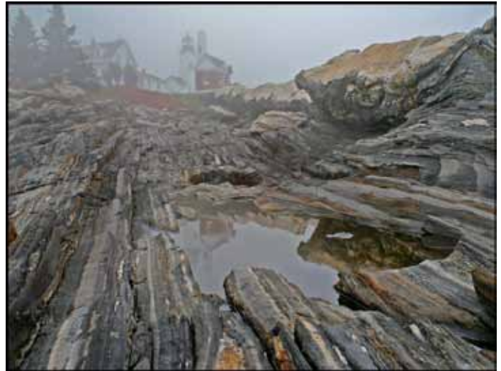
“Pemaquid Point Lighthouse, Bristol, Maine”