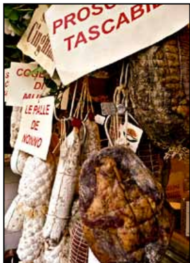
"Butcher Shop Local Specialties" Spello