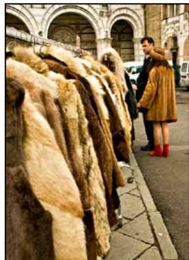
"Shopping for Used Fur Coats" Lucca