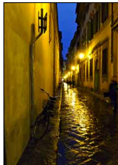
"My Street in the Rain" Florence