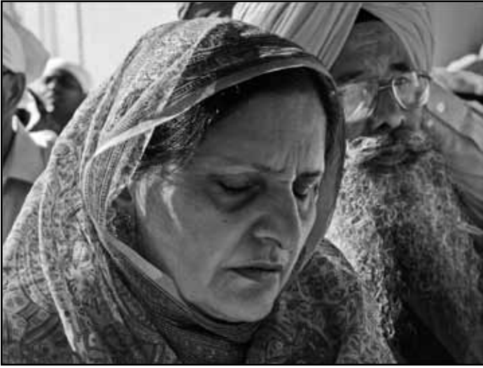
“At Prayer, Sikh Festival” by Sande Parker