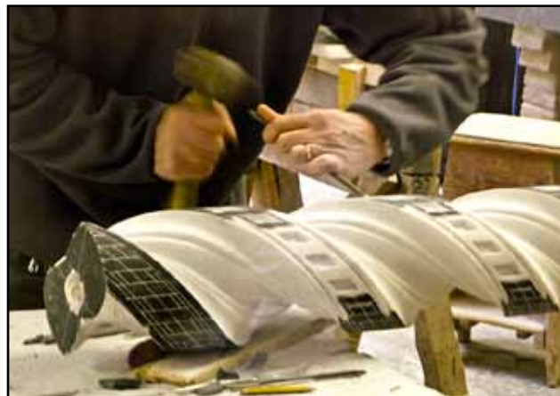
"Copying Duomo Columns by Hand" Florence