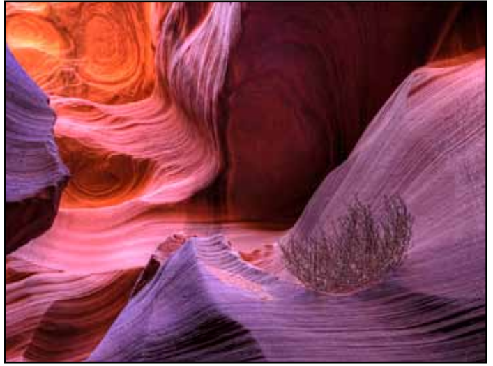
“Antelope Canyon” by Lynne Anzels