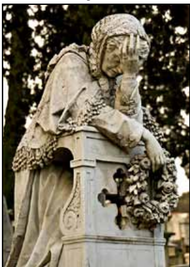
"Marble Marker, English Cemetery" Florence