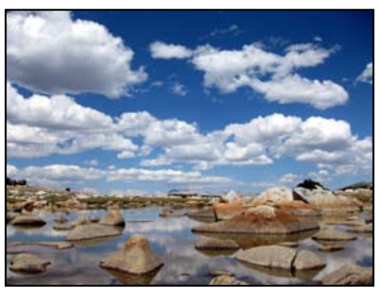
"Yosemite" by Sandy Zacharias

Send me your images as you always do with your name in the title.