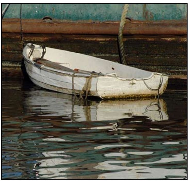
from our February Field Trip to the River City Rowing Club in West Sacramento.

Please send your images for Nature, Travel and Travel Sequences, and we'll see you on April 15th!