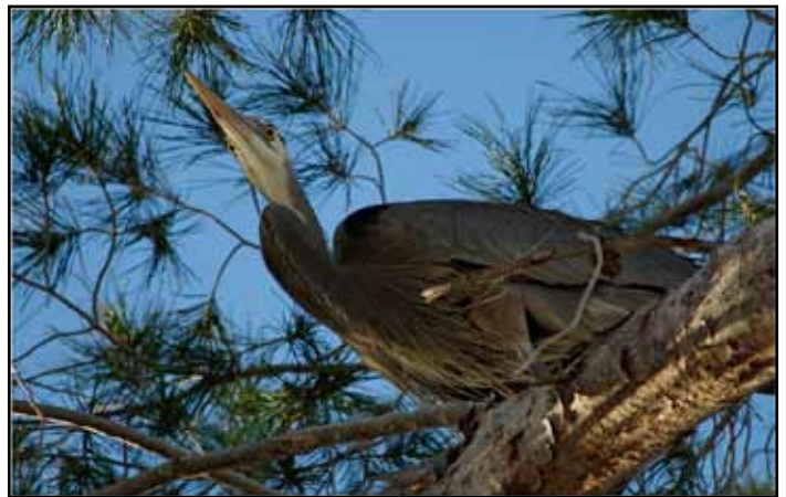
"Great Blue Heron (Ardea Herodias) #1" by Werner Kruger