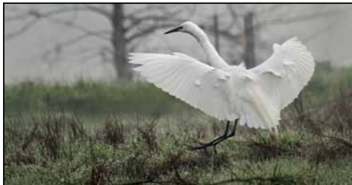
Great Egret Landing on Dewy Field”