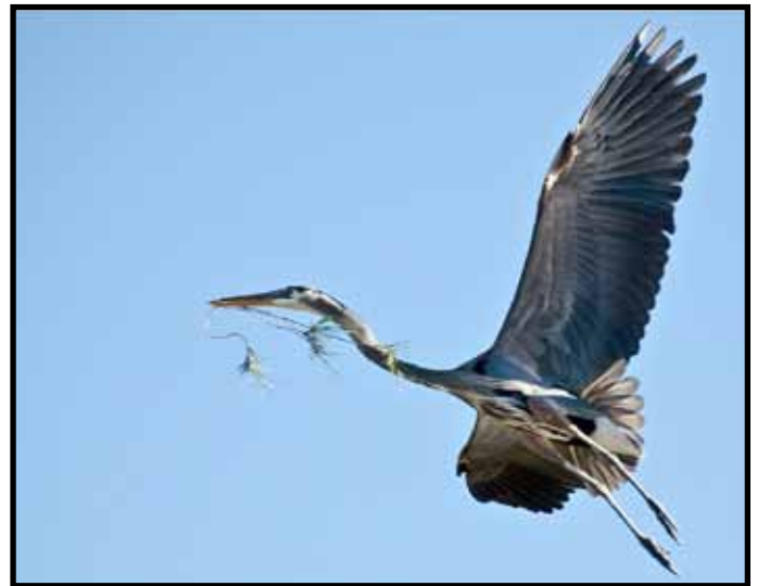
Nature Image of the Night "Great Blue Heron Gathering Nesting Material" by Werner Krueger