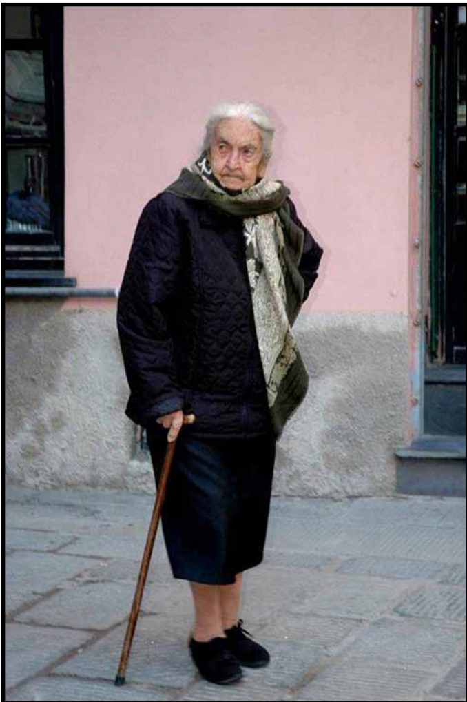
Travel Image of the Night "Italian Lady" by Marcia Sydor

Volume 74 Number 4 * April 2011 * www.sierracameraclub.com