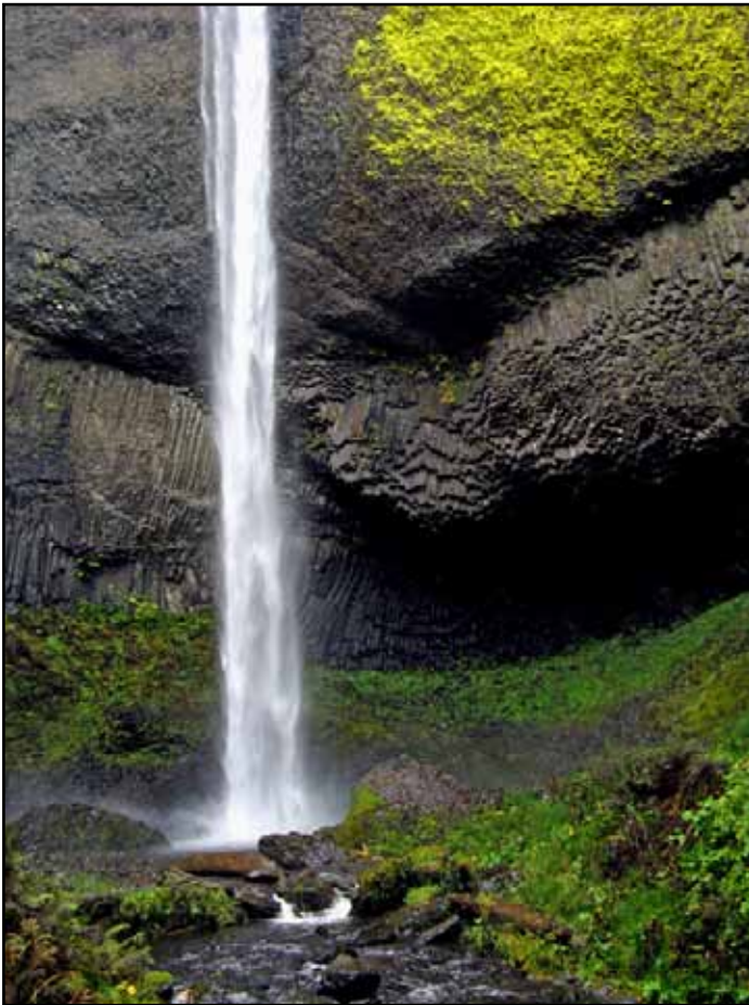
"Columbia Gorge Waterfall" by Al Judd