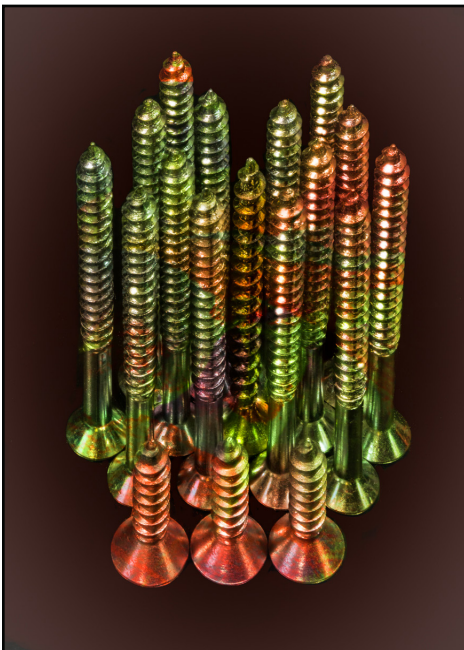
“Screws Up” by Don Goldman