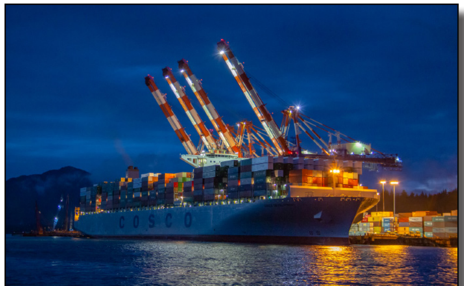
“Container Ship in Prince Rupert, Canada”