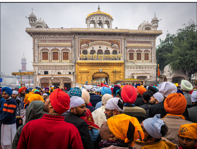
“Entering the Golden Temple Amritsar India” By Don Goldman