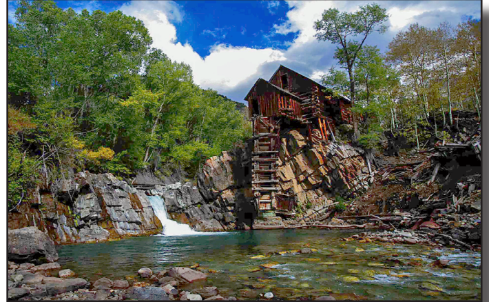
“Crystal Mill Power House” By Truman Holtzclaw