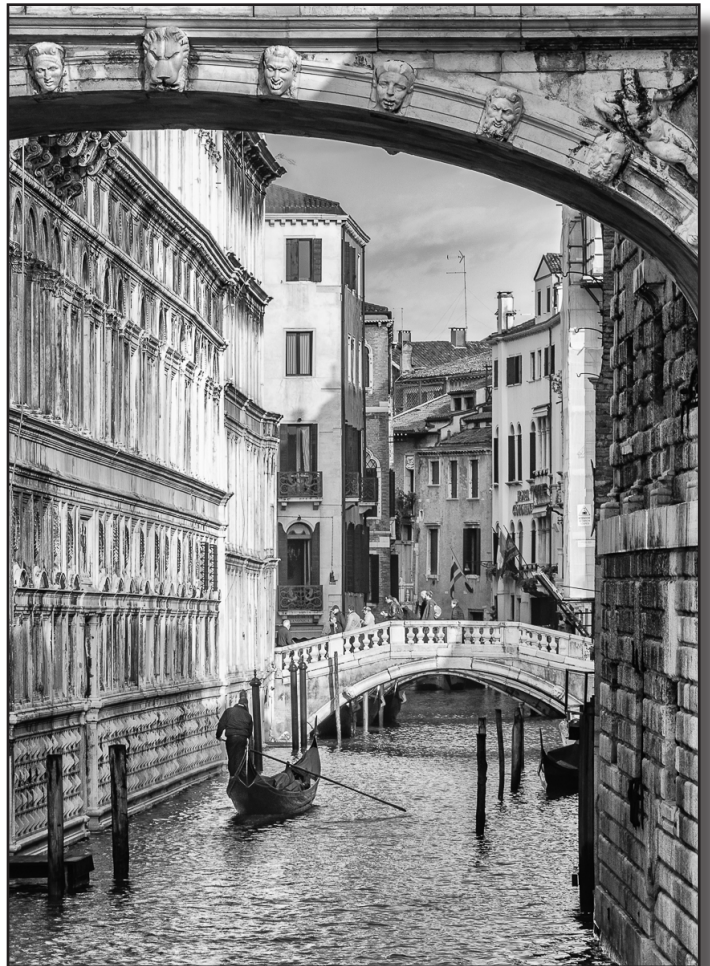
“Venice Scene” By Pat Honeycutt