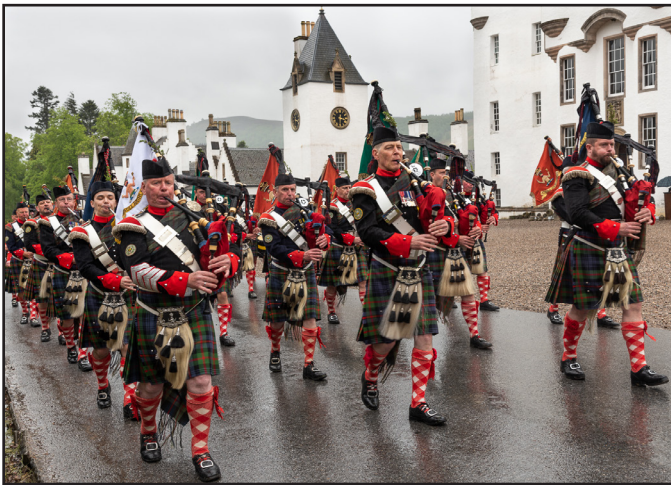
“Atholl Highlanders at Blair Castle Scotland”