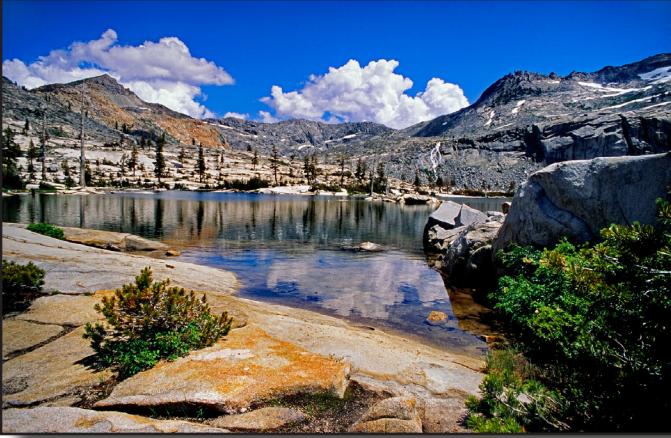
“Twin Lakes Desolation Wilderness”