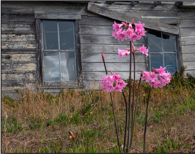
“Mendocino Naked Ladies and Weathered Building” By Steve Papinchak