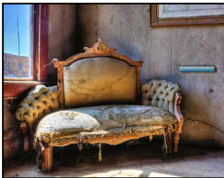
Color Print "Bodie Lounge" by Lynne Anzelec