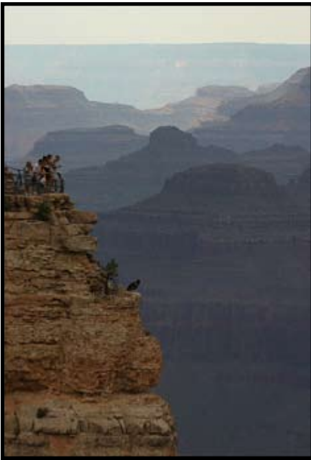
“Grand Canyon Condor”