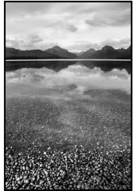
“Lake McDonald, Glacier NP”