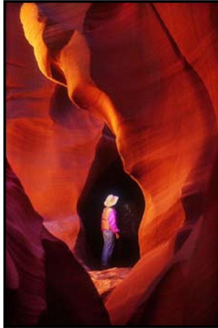
“Antelope Canyon Photographer” by Willis Price