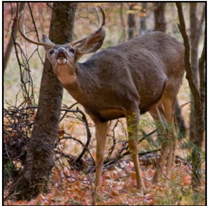
“Buck In Zion” by Gay Kent