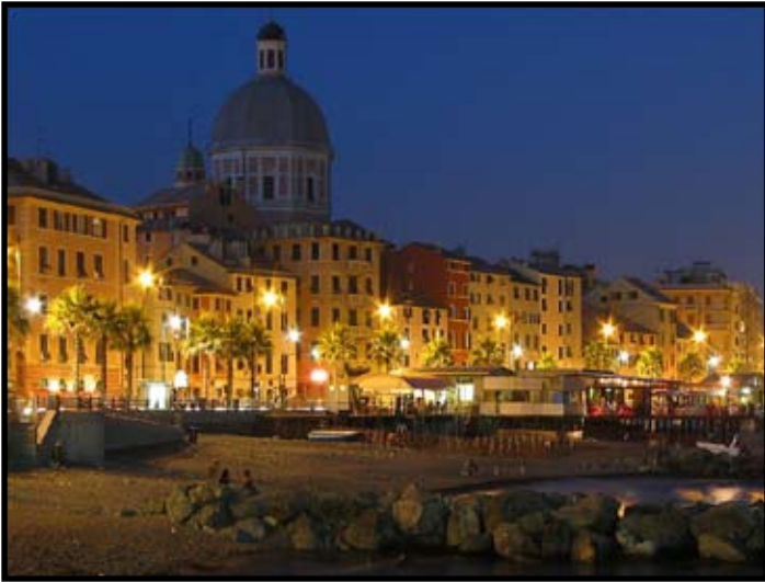
“Genoa At Night”