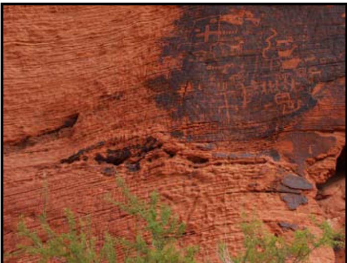
“Valley of Fire Petroglyph”