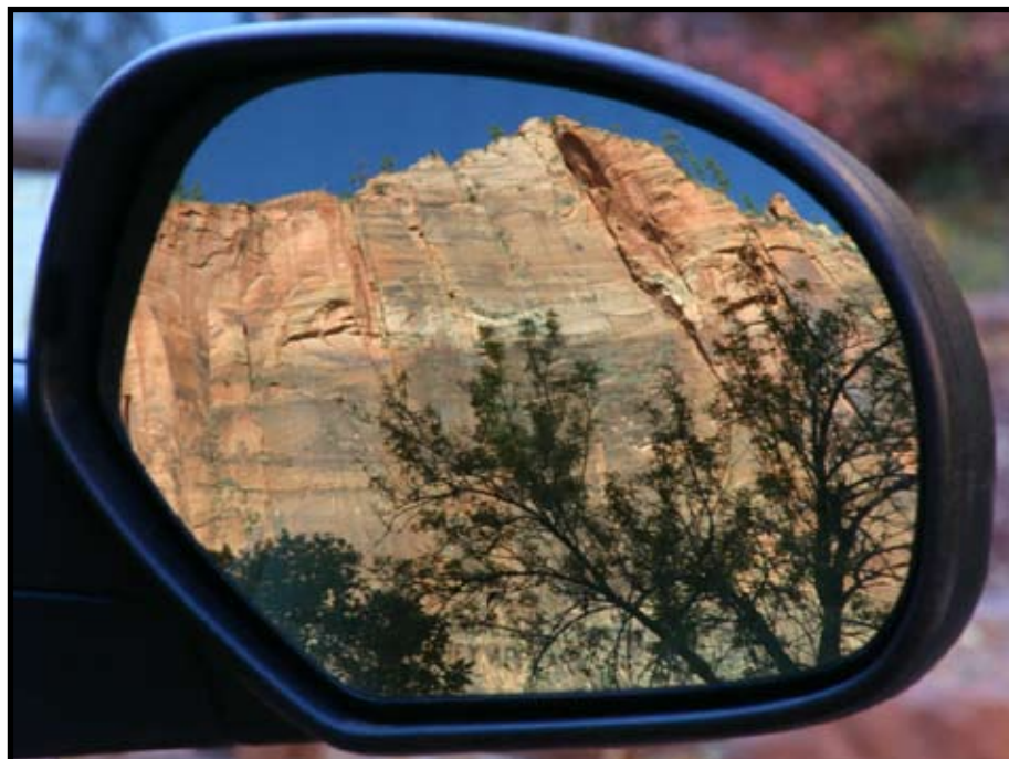
Travel Image of the Night "Zion, Beauty All Around" by Gay Kent