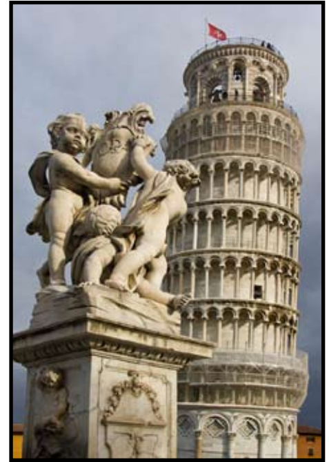
“Pisa’s Big Attraction” by Chuck Pivetti