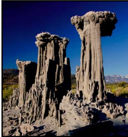
“Sand Tufas” by Chuck Pivetti