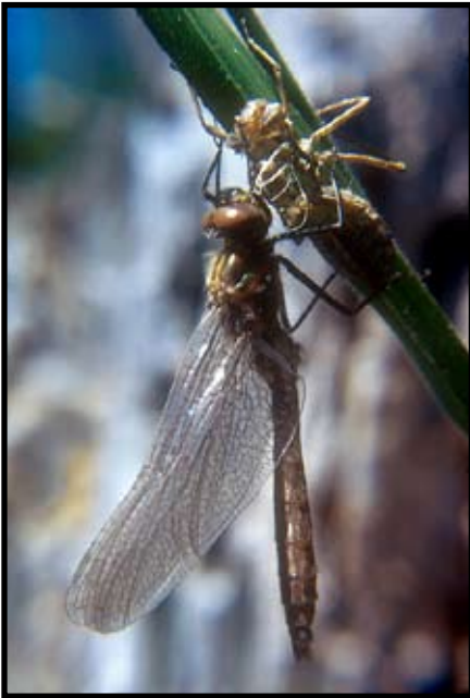
“Dragonfly Moults From Nymph Stage”