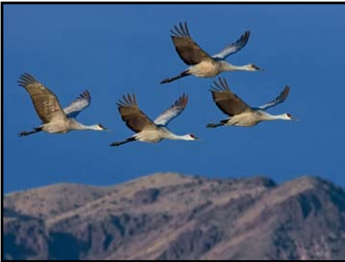
“Sandhill Cranes In Flight” by Julius Kovatch