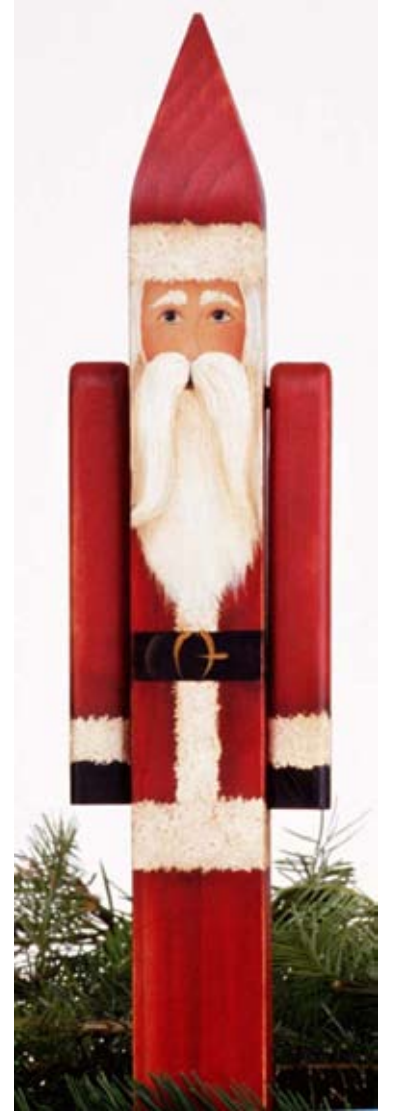
Photo Ops: Lots to shoot during the holiday season. Got kids or grandkids? Shoot them with their presents. The Sacramento Marathon is in early December. I like to

go downtown and photograph them as they cross the finish line. Incredible expressions on their faces. Nevada City, Auburn, Folsom Historic Sutter Street all have events and decorations in early December. Old Sac has a snow fest with real stow trucked in. And of course, there will be lots of Christmas lights. My favorite in town is around 53rd and S Streets but this year we're having a field trip to Penryn for their fabulous display. (See Below.) Finally, on New Years Eve there will be fireworks at Old Sac. The best place to get details on all these events is probably the Sacramento Bee web site. Get out there, folks. Exercise your shutter fingers!