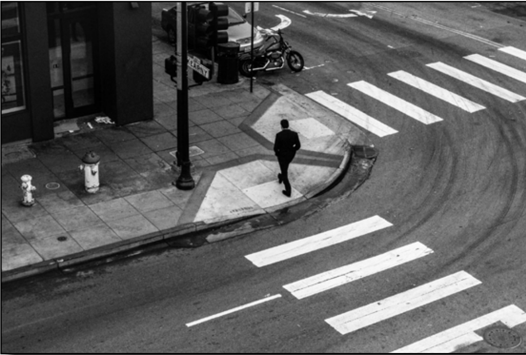
Image of the Night Broadway and Kearny