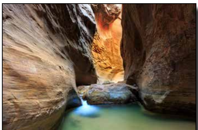
“Orderville Canyon Zion”