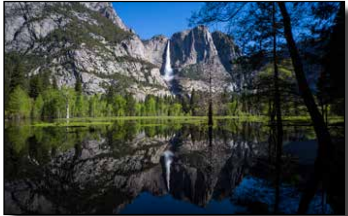
“Yosemite Spring Reflection” by Truman Holtzclaw