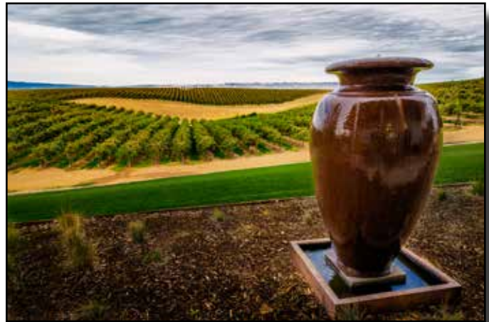
“Yolo County Wine Country” by Lucille van Ommering