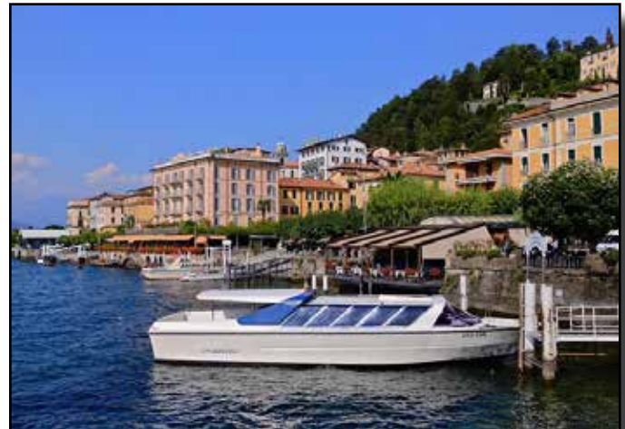
“Bellagio, Italy”