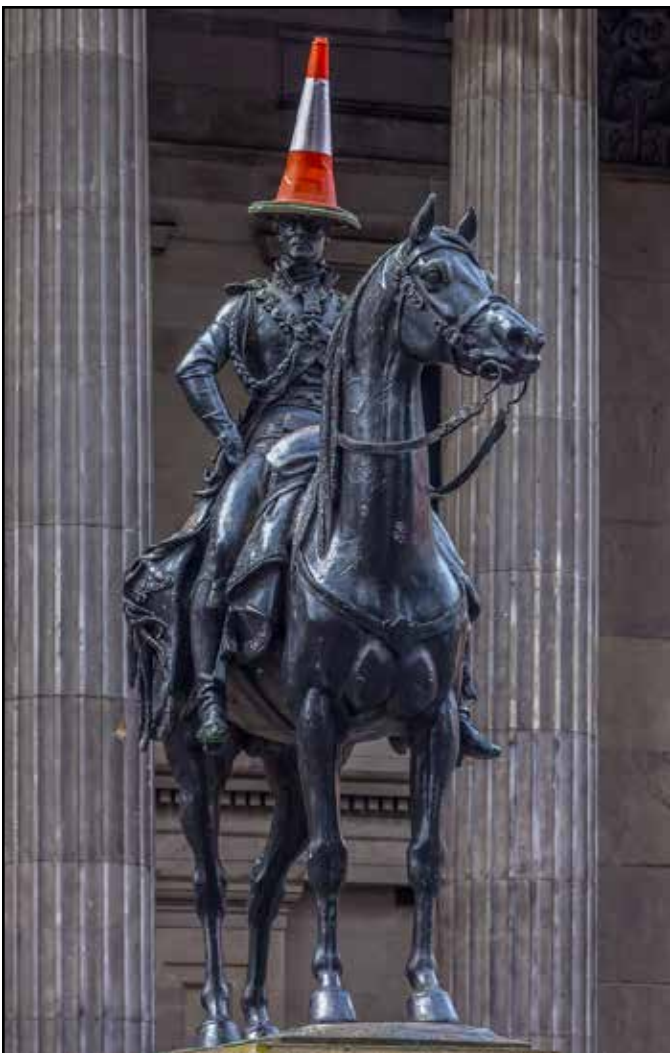
“Duke of Wellington Statue, MOMA Glasgow “ by Don Goldman