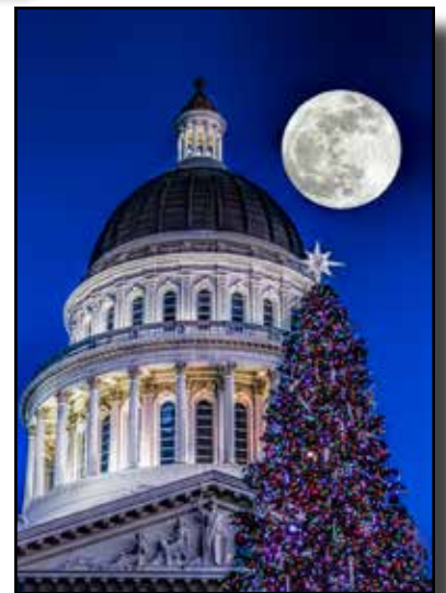
“Moon Over the Capitol at Xmas Time” by Lucille van Ommering