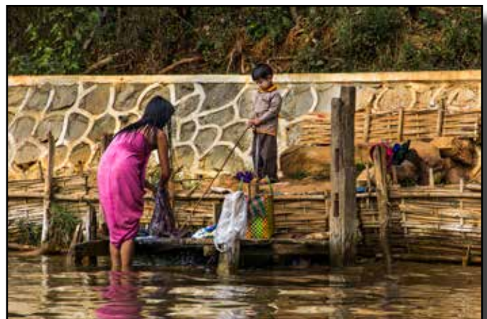
“Laundry Day in Myanmar” by Gary Cawood