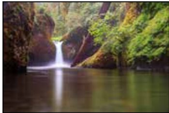
“Rodeo Beach Coastline” by Hayata Takeshita