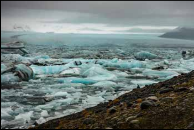
“Glacier and Ice Lagoon, Iceland” by Don Goldman