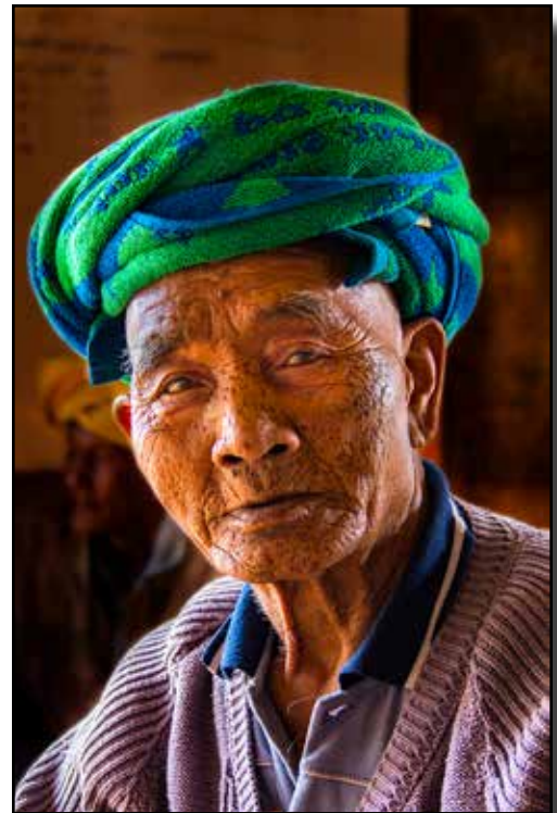
“Myanmar Elder” by Gary Cawood