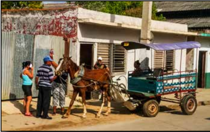
“Horse Transfusion Cuba” by Truman Holtzclaw