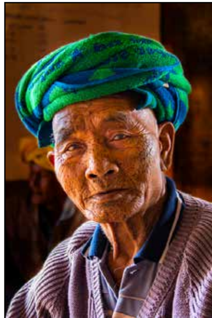
“Myanmar Elder” by Gary Cawood