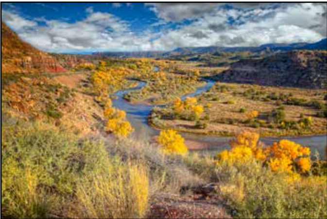
“Chama River Overlook.” by Lucile van Ommering