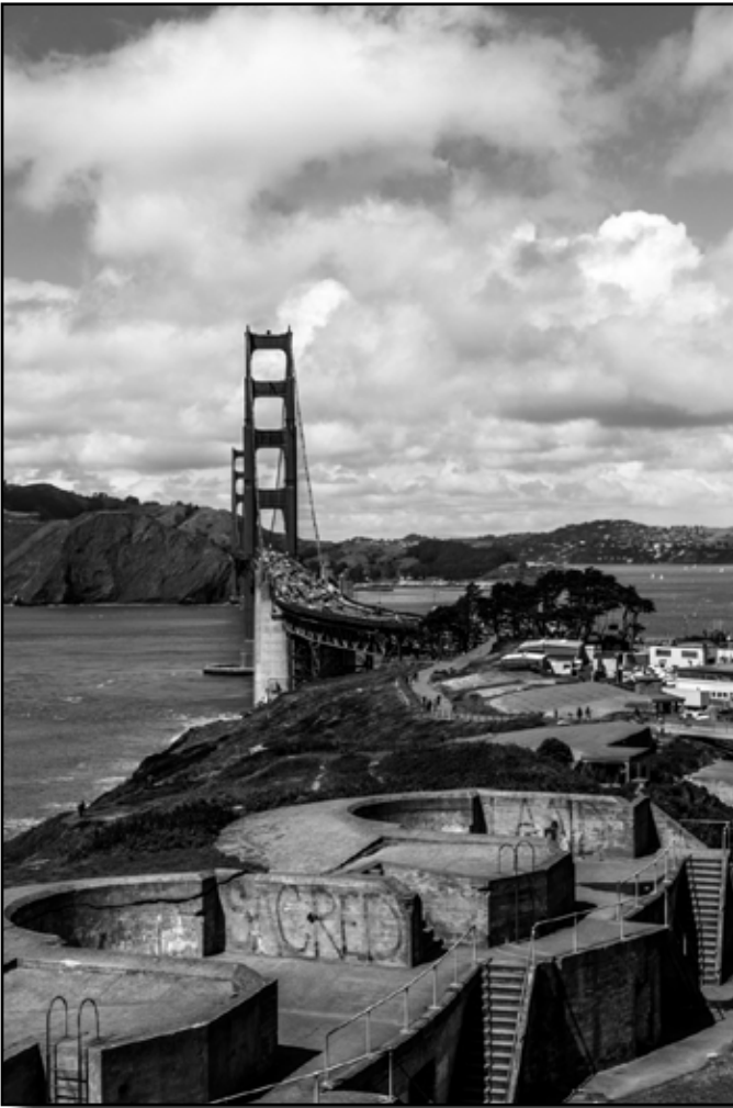
“Golden Gate Battery Funston”