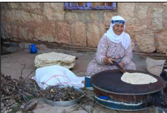
“Over Easy, Turkey” by Laurie Friedman